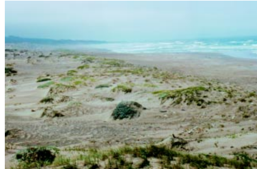
Plover habitat at Montaña de Oro State Park

Plovers can be found on flat, open coastal beaches in dunes, and near stream mouths. They are well-camouflaged and extremely hard to see, often crouching in small depressions taking shelter from the wind. California State Parks beaches provide much of the suitable habitat remaining in California for this small shorebird.