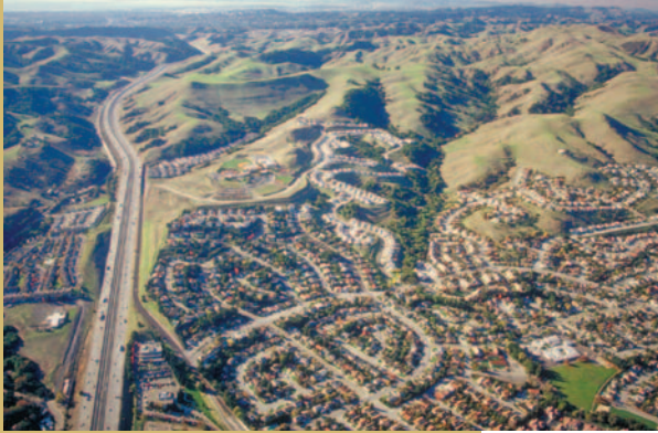
Lands not acquired now may be unavailable or prohibitively costly in the near future.

California's population will approach 50 million before 2040.