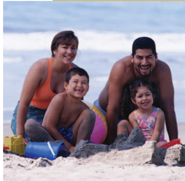
Many Hispanic outdoor recreationists continue to retain traditional Hispanic family values regardless of how long they have lived in the United States.

Californians are using advances in technology and transportation to expand their outdoor recreation opportunities. Californians love personal vehicles and outdoor recreation gear. They use both to expand their outdoor recreation opportunities. California's expansive road system provides access to far-flung destinations, and vehicles of every imaginable size and shape routinely hit the road in search of scenic vistas or active adventures. Once Californians arrive at their destinations, they set off on muscle-powered, mechanized, or motorized outdoor recreation equipment for further adventures and exploration. All-terrain equipment and navigational aids (e.g., Global Positioning System units, customized digital mapping software, and cellular phones) allow more people to go farther faster than ever before. All this equipment-aided outdoor recreation is costly to the consumer and to service providers. Though pursued in natural places, mechanized and motorized outdoor recreation, in particular, require infrastructure in the form of trails and staging areas. They also require a different style of management for visitor safety, noise, user conflicts, and environmental disturbance. This is a growing area of outdoor recreation and a cause of user conflict and managerial concern.