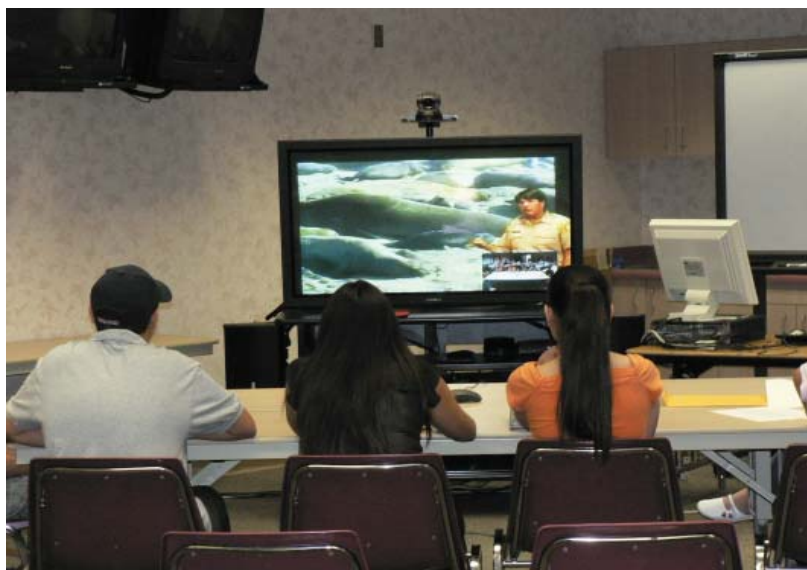
Desert Sands Unified School District students learn about elephant seals via a PORTS presentation from Seacliff State Beach

California State Parks and the HCOE are partners in an initiative to use technology to bring compelling content to a largely rural and isolated population of students. The HCOE has contributed 40 percent of a teacher personnel year to work with park staff to implement the PORTS program throughout Humboldt County. The State Parks benefit by creating close relationships with school districts throughout the county and by delivering our message to the student population. The schools benefit by learning to use technology to communicate with distant entities and by having “content experts” to help them teach academic content standards.