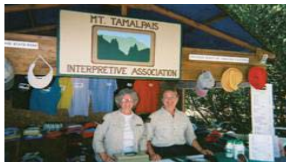
Mt. Tamalpais Interpretive Association sales area