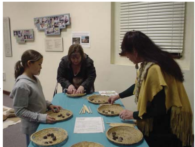
Hands on program at the Museum of History and Art, Ontario, CA.