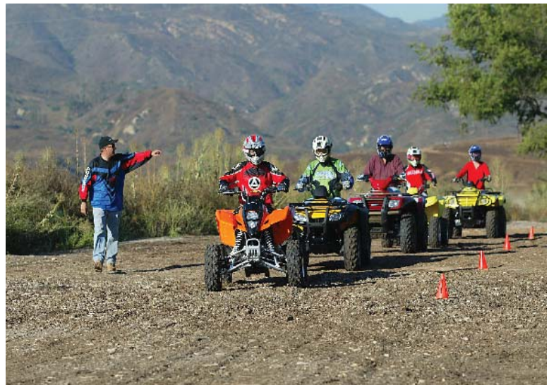
SVIA Training Session.

ATV Safety Institute 2 Jenner St, Ste 150 Irvine CA 92618-3806 Phone: 949 727-3727 www.atvsafety.org