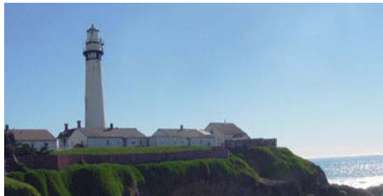
Pigeon Point Light Station SHP