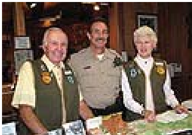
Visitor Center, Humboldt Redwoods SP

CALPA can act as an unofficial conduit for information between CSP and association members. CALPA conferences provide valuable training opportunities.