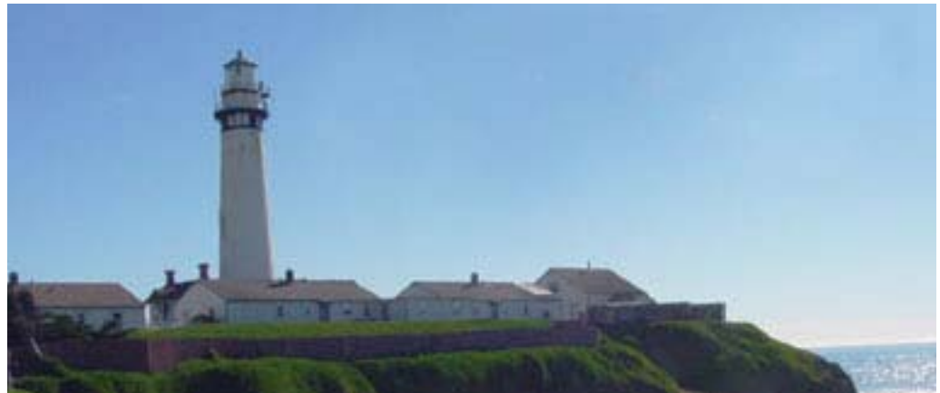
Pigeon Point Light Station SHP

Visit the Concession Program's web pages at www.parks.ca.gov/concessions , or contact the park units listed above for additional information on each partner.