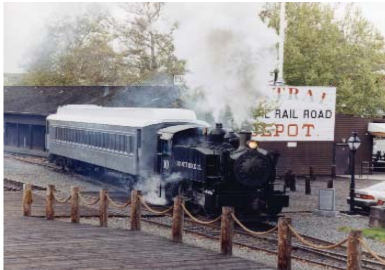
California State Railroad Museum