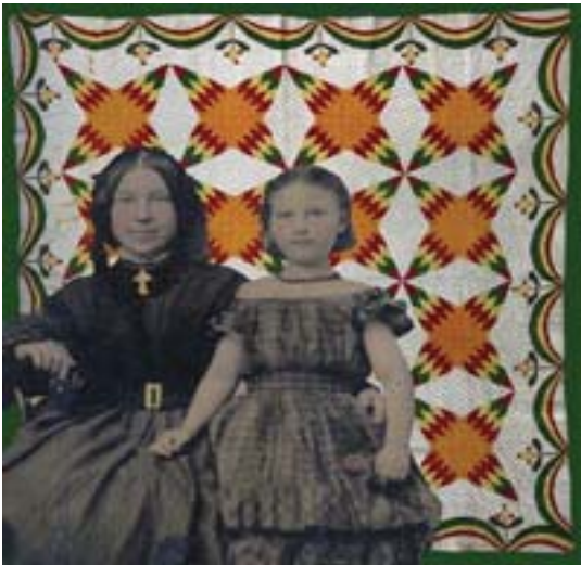
"Treasures from the Trunk."

California State Parks has collaborated with the Museum on several exhibits, including "California's Remarkable Women," "Treasures from the Trunk" and "Latinas: The Spirit of California." The increased visibility of artifacts from the department's collections in these exhibits heightens public awareness of the cultural resources the department maintains. The exhibits are valuable tools in the interpretation of the state's heritage.