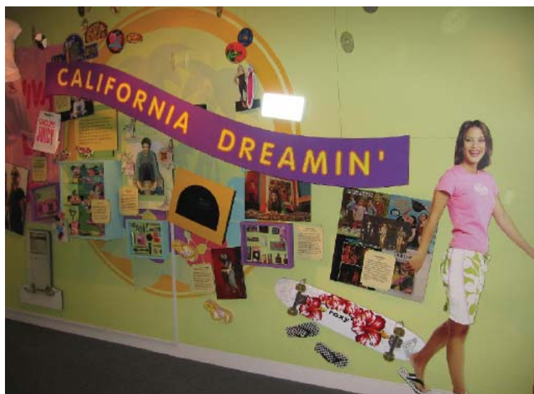
"California's Remarkable Women."