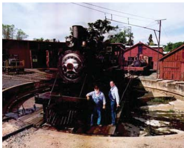
Railtown 1897 SHP