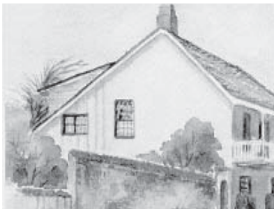
Whaler's Cottage, Monterey SHP