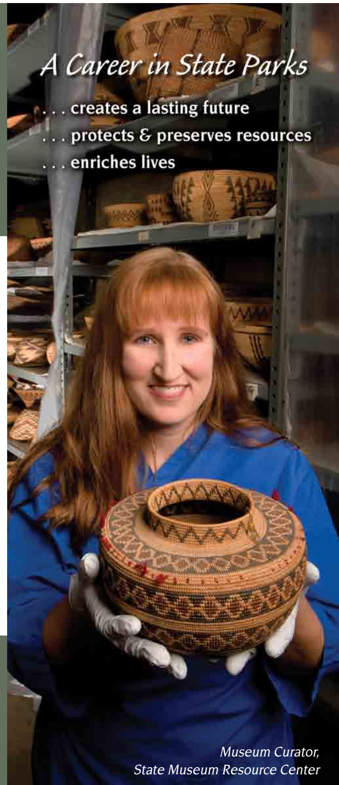
Museum Curator, State Museum Resource Center