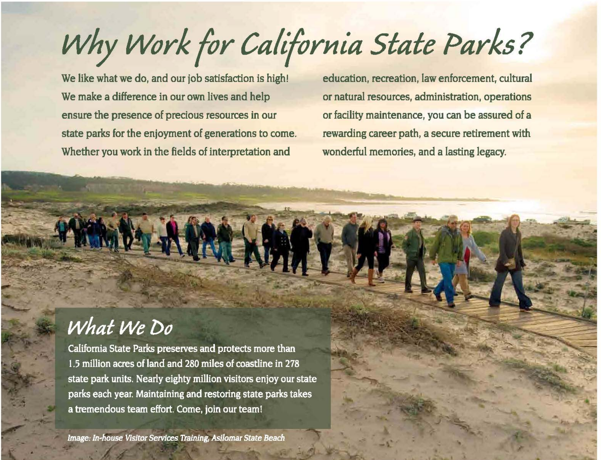
Image: In-house Visitor Services Training, Asilomar State Beach

California State Parks preserves and protects more than 1.5 million acres of land and 280 miles of coastline in 278 state park units. Nearly eighty million visitors enjoy our state parks each year. Maintaining and restoring state parks takes a tremendous team effort. Come, join our team!