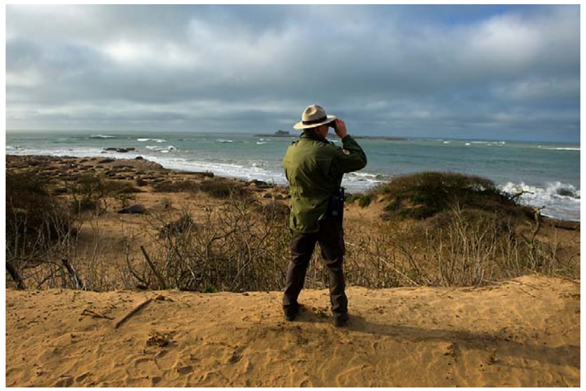
Becoming an expert on the nature of your park means spending as much time out in it as possible

Build on your experience-based knowledge by reading a wide variety of sources of written information about your park's resources. Don't rely on the same book that everyone uses. Read that book or article and find three more. Talk to other park staff. The greatest wealth of knowledge about a park is often held by senior rangers, scientists,