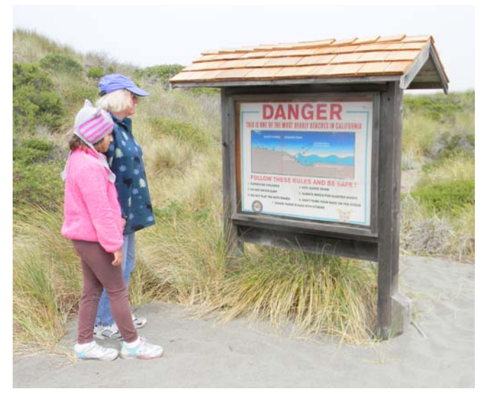
Visitors must recognize the dangers and understand how to keep themselves safe.

In addition to protecting the visitors' experience, we must also protect their physical safety. This is