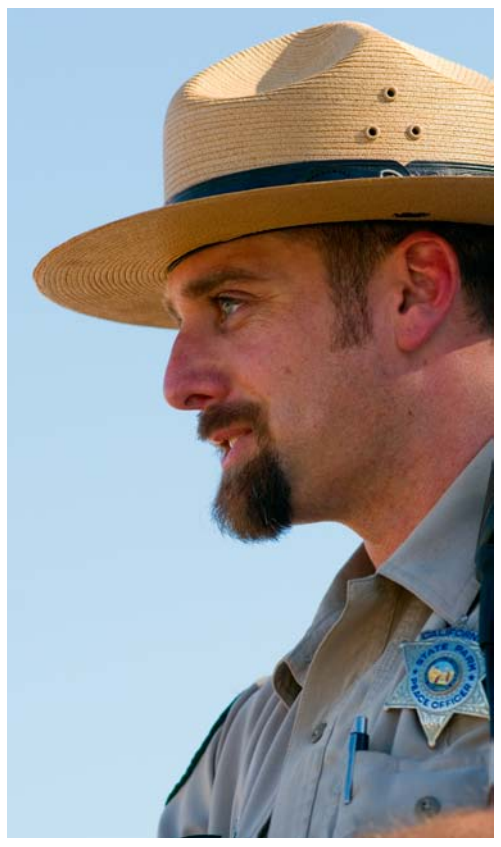
Interpretation is a valuable tool for generalist park rangers.

We connect the visitor to the resource by developing interpretive programs that address California State Parks in one or more of these four areas: cultural resources, natural resources, recreational resources, and our agency values or management. In all four areas, the interpreter is challenged to go beyond merely teaching facts to revealing meanings that are relevant to the audience.