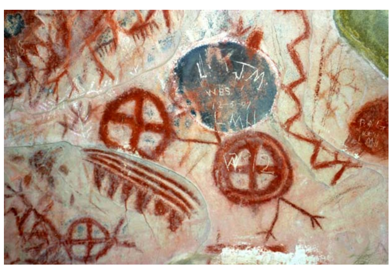
Most depreciative behavior occurs not out of malice, but out of ignorance.

A second reason to attempt to control behavior through interpretive means is that recreation areas and parks are considered some of the last places that humans can be free. To escape the rules and restrictions of society is one of the driving factors that push people into the outdoors (Knopf, "Human Experience of Wildlife: A Review of Needs