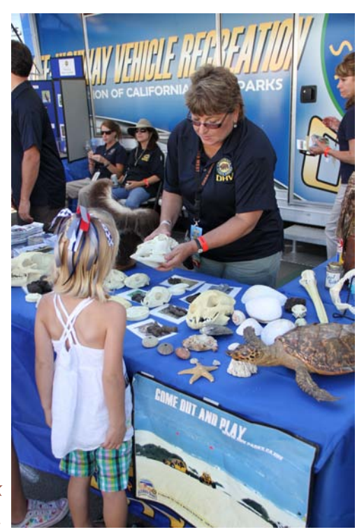
Without public support, park management goals will fail.

There are many benefits to providing interpretive messages regarding the management of the resource and we'll discuss them in more detail later in this module. In addition, interpreters must consider the many different motives that bring visitors to the programs. A successful park-wide interpretive effort will include a variety of messages, programs, and communication techniques.