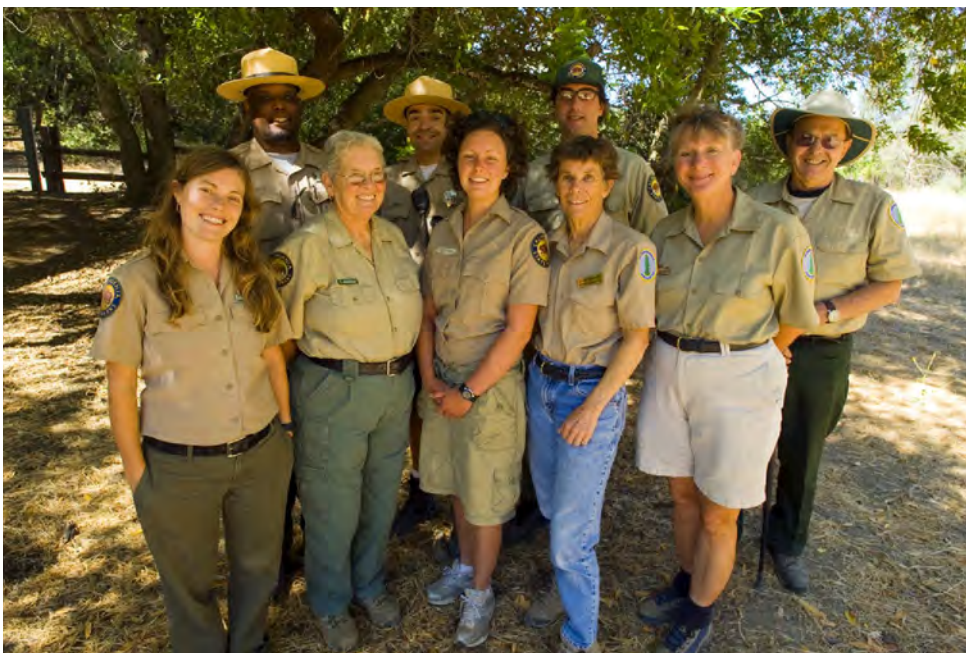
The future of interpretation is up to each of you.

Our mission is one of distinction and importance. "It is a worthwhile life work and one that will add immeasurably to the general welfare of the nation" (Mills, 1920, p. 140). Especially in this day and age of dissolution, environmental degradation, terrorism, fear, and general unease, the parks and our connections to them are critical. Not only is connecting the public to natural and cultural resources important to the overall health of the nation, but interpretation of the critical issues facing the country and our people is important. Who better than an interpreter to help make sense of the issues we face? Is that not our job, to translate the science, link people to the places, and speak for the issues? We cannot and should not restrict ourselves to just the simple topics. Instead, we should tackle those that are difficult, complex, and unclear. These critical managerial, political, and emotional issues are the worlds we should help illuminate for the public and for ourselves.