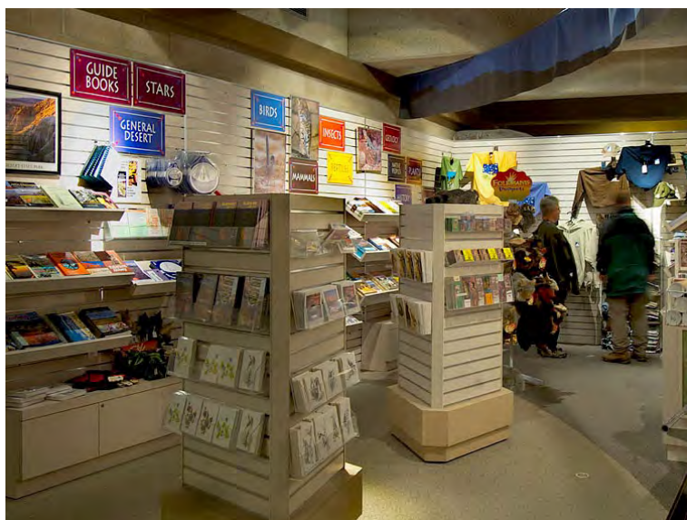
Bookstores are one of the most common interpretive services provided by cooperating associations.

CSP. These organizations provide program support, raise capital needed for interpretive projects, conduct community outreach, participate in annual training and workshops, and provide educational and interpretive materials for sale through numerous outlets. Wherever a visitor center or bookstore is found, chances are a cooperating association is involved. As with VIPs, working closely with your cooperating association to provide professional interactions with the public should be a priority. The presence of cooperating associations extends the reach of park personnel already stretched thin. Communicating with your cooperating association pays dividends and increases the overall effectiveness of your park’s interpretive services. Policies, guidelines and other essential information about the Cooperating Associations Program are available at www.parks.ca.gov/associations .