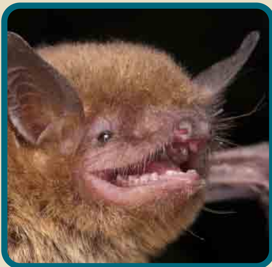
Big brown bat

Bats are nocturnal, resting all day in caves, buildings and other quiet places.