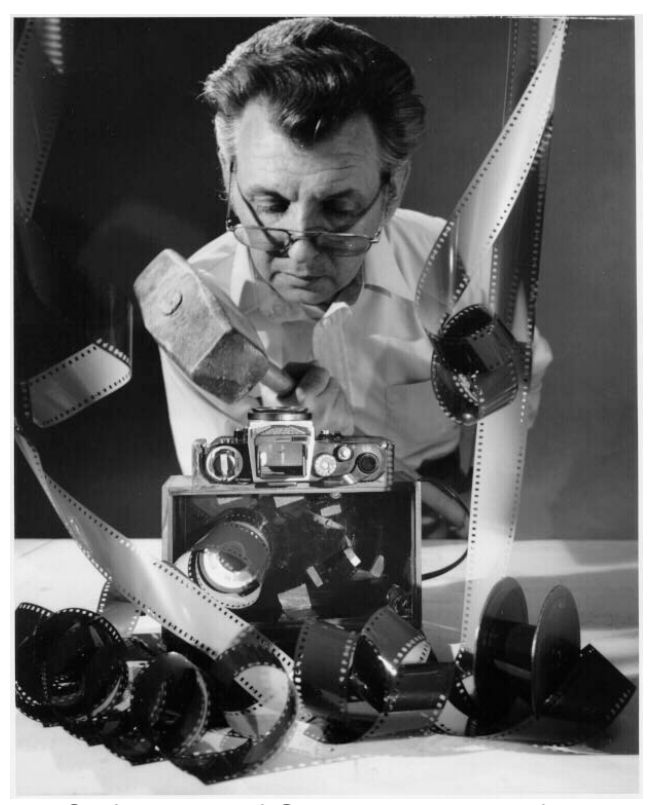
Self-portrait of Gene Russell, the first professional photographer employed by the Department of Parks and Recreation.

The Photographic Archives became part of the Interpretation Section in 1991, providing a secure, controlled environment for many of the Department's photographic images. When the Interpretation Section transitioned to the Interpretation and Education Division, the Photographic Archives became one if its initial Sections. The Photographic Archives continued to evolve, leaving the chemical darkroom model behind in 2006 to embrace the new digital darkroom model. Consisting of prints, negatives, glass plates, lantern slides, color slides, "born digital" images, and supplementary research files, the Photographic Archives continues to grow and assist staff in planning restorations, creating interpretive programs, and documenting concessions and visitor activities. In addition, the Photographic Archives serves as a valuable information resource for students, scholars, authors, and more. The Photographic Archives continues to expand its contemporary holdings through the original digital photographic work of Department photographers. The Photographic Archives also adds to its historical holdings by accepting and housing images previously held in park units and by individuals.