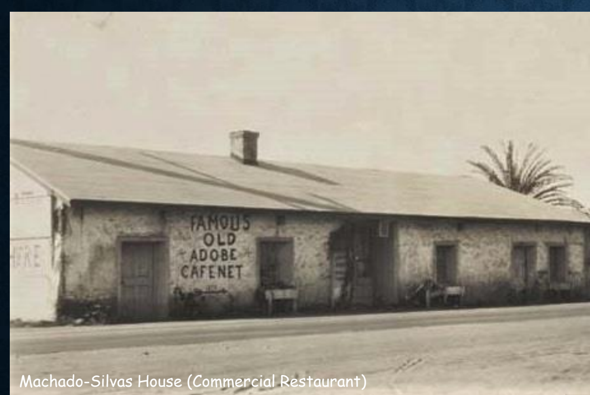
Machado-Silvas House (Commercial Restaurant)

The Machado-Silvas home as it looked many years ago and as we see it today. It was a family home and a restaurant serving many travelers passing through town on horseback, stagecoach, and by sailing ship.