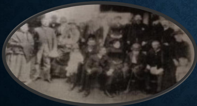
This photograph shows some of the people who lived here in the past.