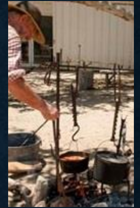
Cook a meal