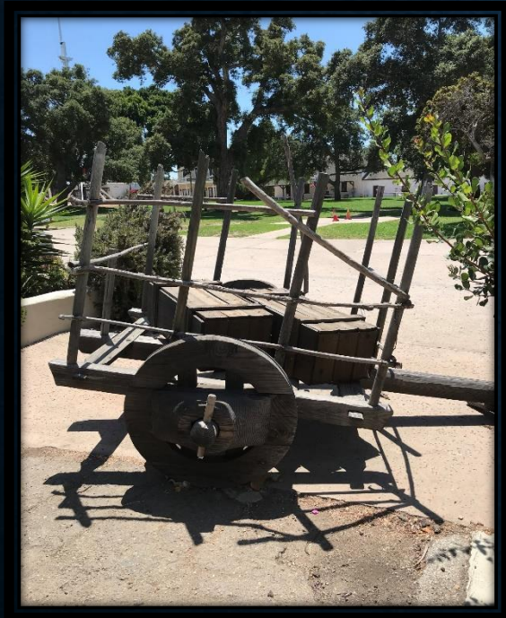
A 'carreta' or cart

ACTIVITY: On page nine of your logbook, draw a picture that would help people in the future know how you lived today.