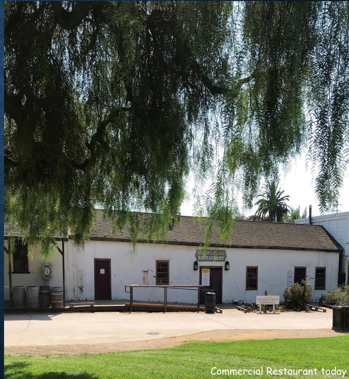
Commercial Restaurant today

The Machado-Silvas home as it looked many years ago and as we see it today. It was a family home and a restaurant serving many travelers passing through town on horseback, stagecoach, and by sailing ship.