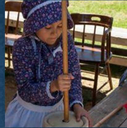
Churn or make butter