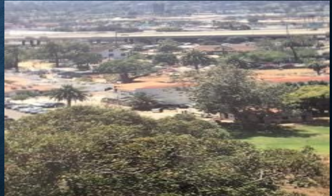
Old Town, 2020