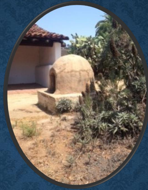
An 'horno' or oven

These pictures represent artifacts - objects made by people. They can be seen around Old Town San Diego State Historic Park. People who lived long ago may have made and used a cart or oven such as these.