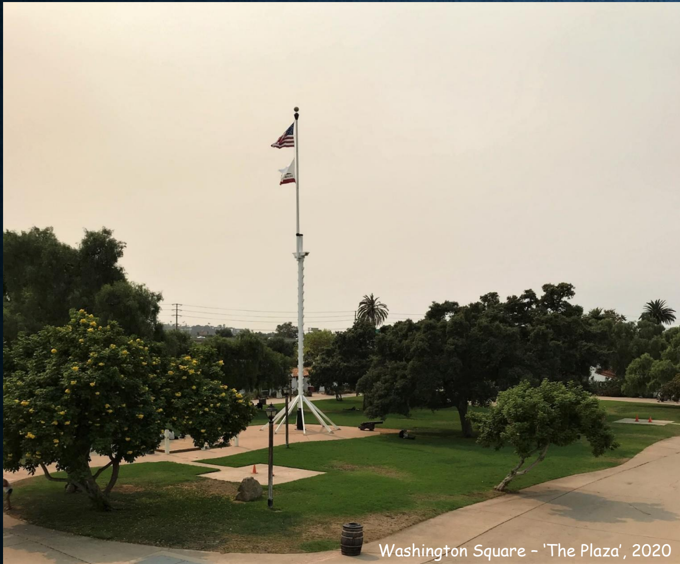
Washington Square - 'The Plaza', 2020

Old Town San Diego State Historic Park helps to preserve our history. Some of the buildings seen today have been restored or rebuilt. Preservation and restoration are ways to keep our history for future people to enjoy. Most of these places are now museums and represent how the people of the past lived. The past is our history - part of who we are today.