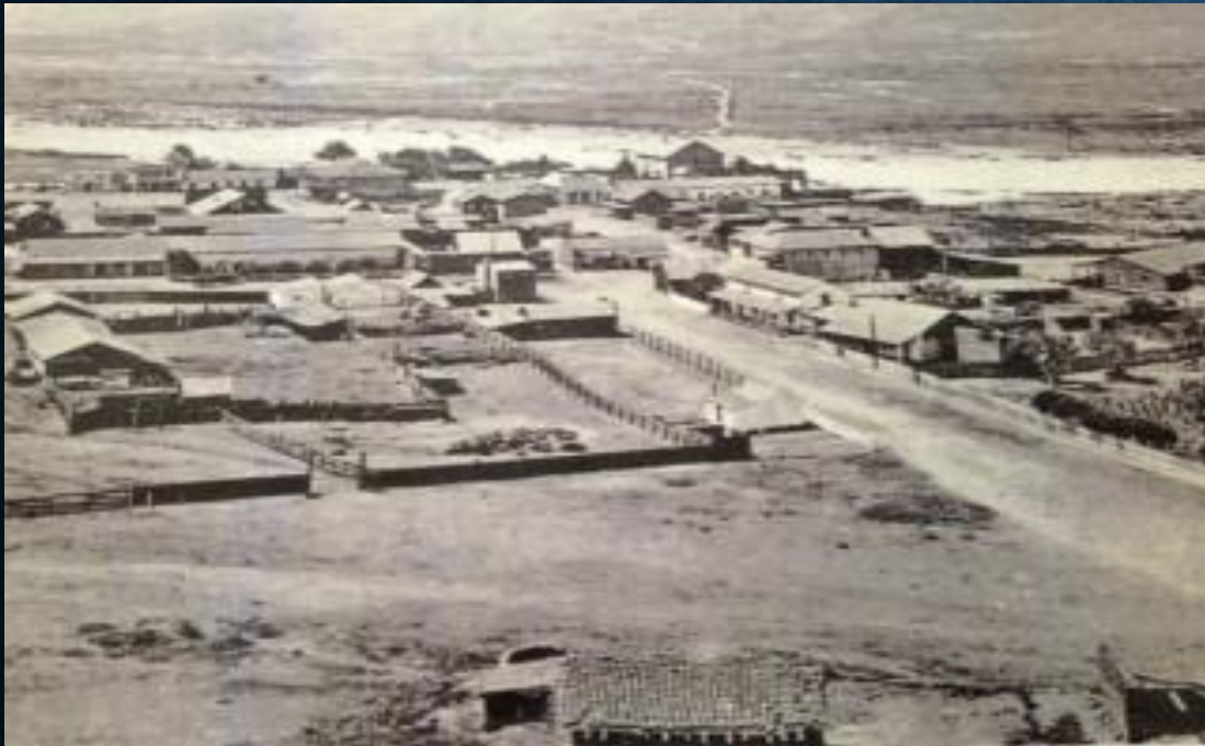
Old Town, 1800s