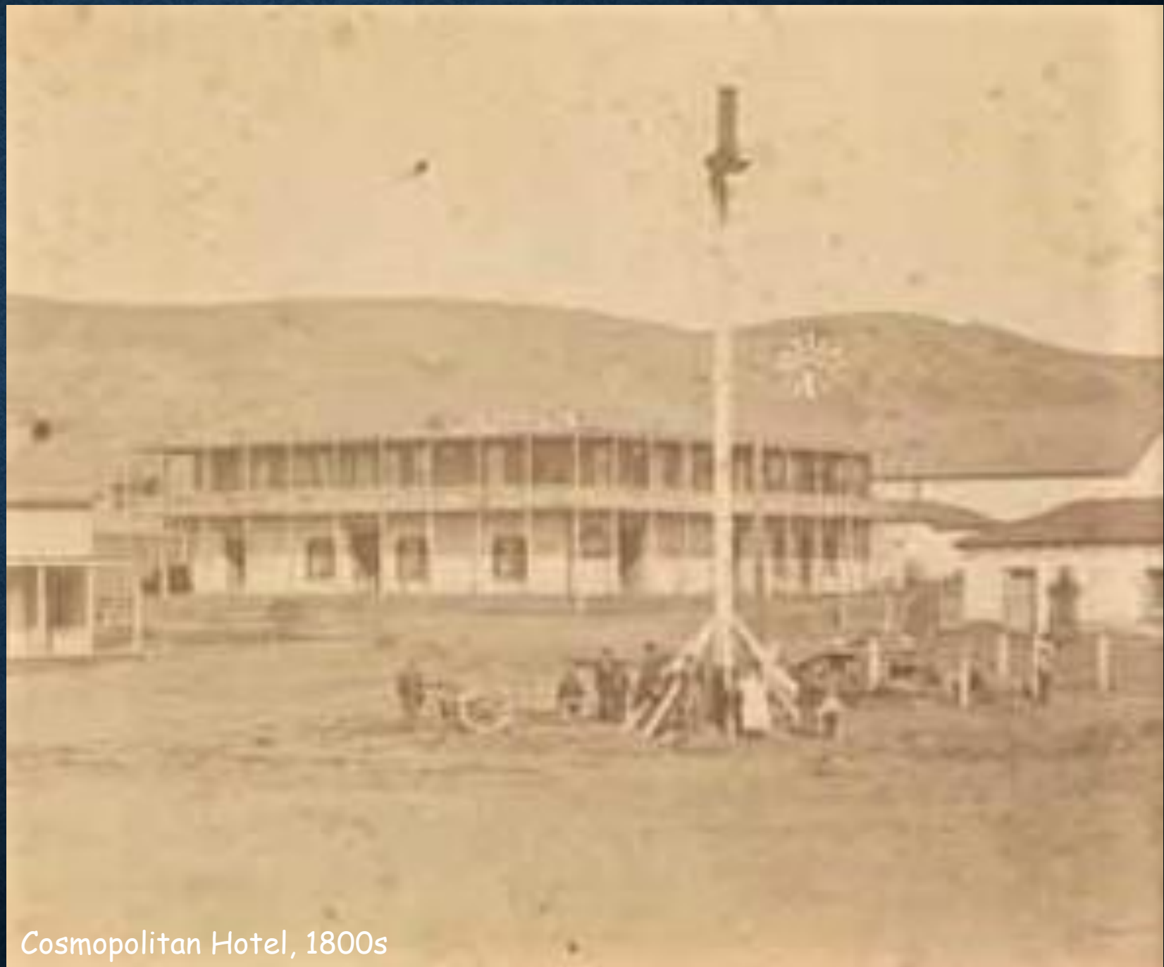
Cosmopolitan Hotel, 1800s

We define history as a ‘record’ or ‘story’ of the past. Family history – those baby photos of you! – are a part of your past. This photo is part of San Diego’s past or history. It shows the same hotel. Do you notice any changes? Look closely at both pictures and see how many different things you see.