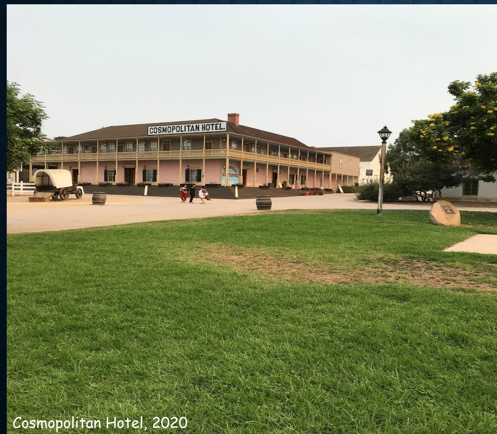
Cosmopolitan Hotel, 2020