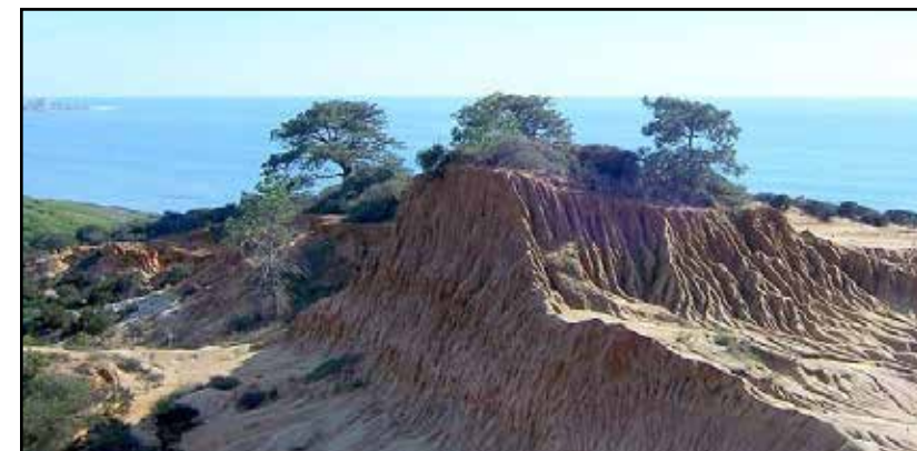
View from Broken Hill overlook

Reserve's longest trail, including access to the beach. Features chaparral, few trees, and scenic overlook pictured below.