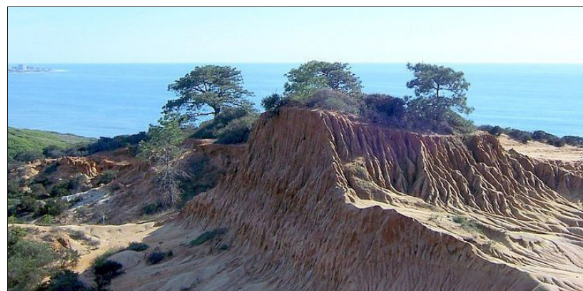
View from Broken Hill overlook

North fork 1 1/4 miles South fork 1 1/3 miles Reserve's longest trail, including access to the beach. Features chaparral, few trees, and scenic overlook pictured below.