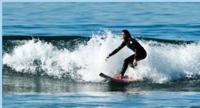
Two miles of beach break are ideal for surfing.