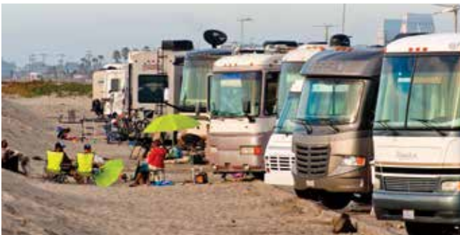
Beachfront RV camping is very popular.

The southern end of the bay is a perfect bird-watching area; hundreds of thousands of birds feed, nest or just rest up here for the next leg of their migrations.