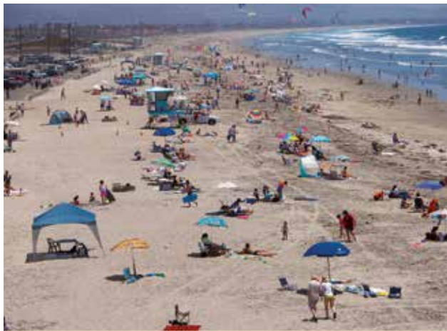
A typical day at Silver Strand State Beach

It is believed that humans first came to the San Diego coast as far back as 20,000 years, and to inland areas about 12,000 years ago. The native people were known by many names, some bestowed by the Europeans, who called them Diegueños or Mission Indians. The names preferred by the people themselves included Kumeyaay (the inland group), Ipai (the northern group), and Tipai (the southern group).