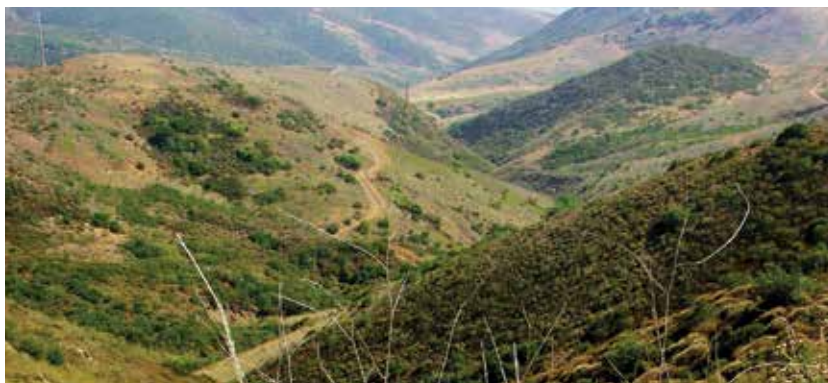
Backcountry wilderness area—part of the Irvine Ranch National and California Natural Landmark