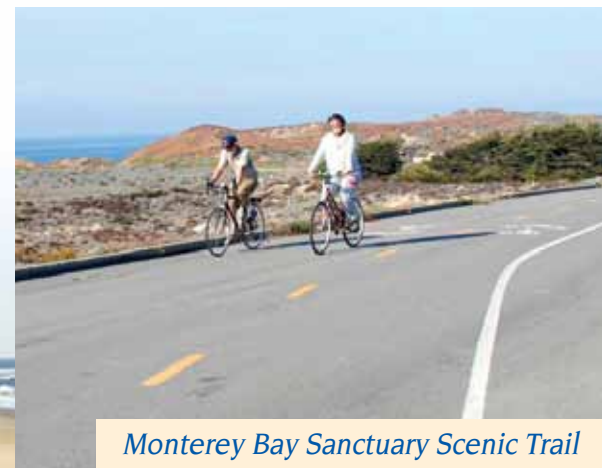
Monterey Bay Sanctuary Scenic Trail

Salinas River Mouth Natural Preserve and Salinas River Dunes Natural Preserve form a portion of this park. A mile of dune trail begins in two of the three parking lots, and it links two coastal access points.