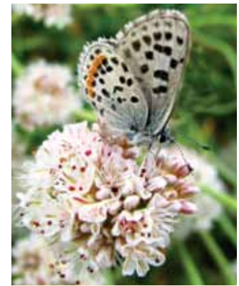
Smith's blue butterfly

Pelicans, grebes, Caspian terns and gulls fly over the sea, hoping to find such prey as surf perch, rockfish, squid and night smelt. Step carefully to avoid the nest of the western snowy plover, a small, threatened bird that blends into the beach sand.