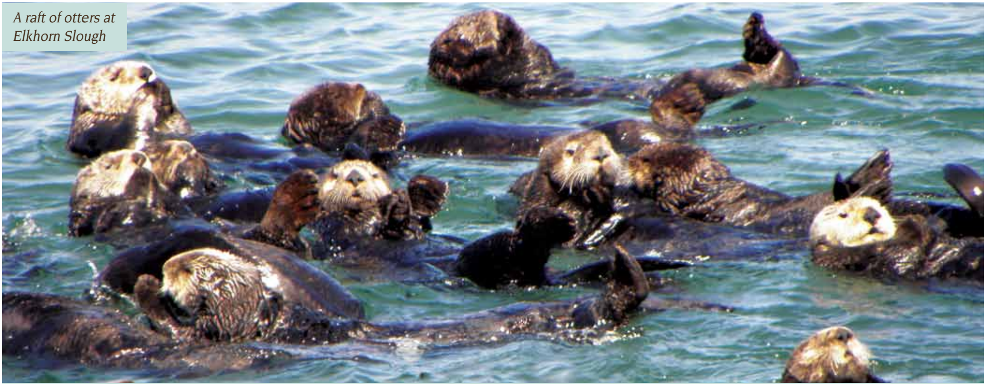
A raft of otters at Elkhorn Slough