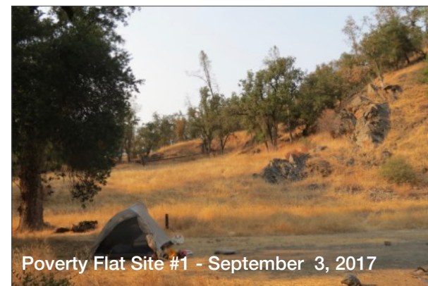
Poverty Flat Site #1 - September 3, 2017