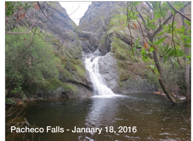
Pacheco Falls - January 18, 2016