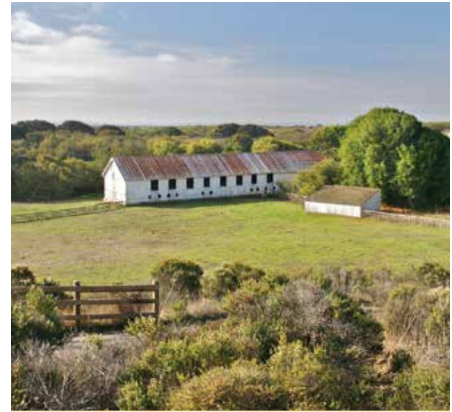
Historic dairy complex