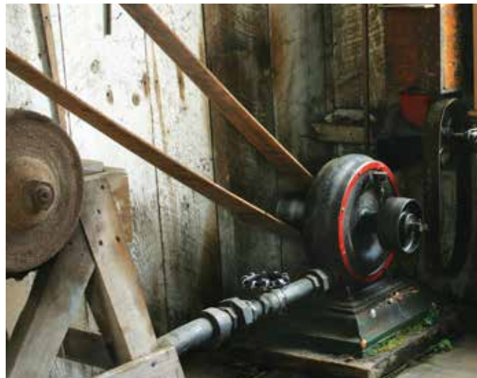
The Pelton water wheel drives the dairy and farm equipment.