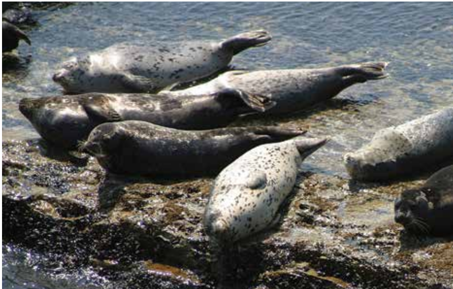
Harbor seals at rest

Rainwater carves steep canyons through the marine terraces. Douglas-firs and coast redwoods dominate the drainages while coastal prairie covers much of the flatter terrain. Manzanitas, knobcone pines, and chaparral pea grow in drier, sandier inland soils. Grasslands and oak woodlands are home to deer, bobcats, coyotes, and mountain lions. Snowy plovers make their nests on Wilder Beach Natural Preserve, which is closed to public exploration. Harbor seals and sea otters gather where Wilder's watersheds join the Monterey Bay National