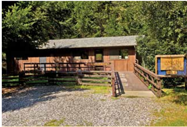
Accessible visitor center

Hiking —Inviting trails allow visitors to photograph mushrooms in January, spot newts in February and orchids in March, or to stroll among alders on Six Bridges Trail.