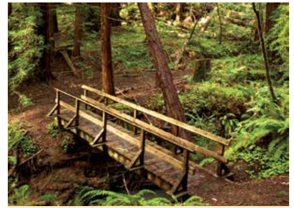
Bridge access over Butano Creek

Accessibility is continually improving. Visit http://access.parks.ca.gov for updates.