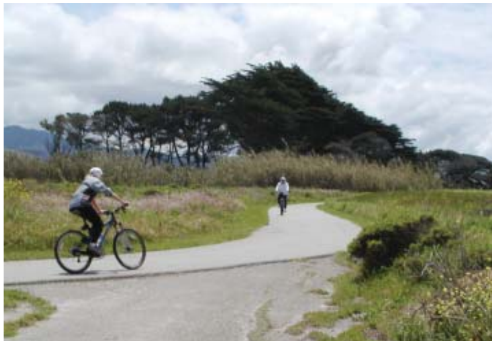
Bikers on the Coastside Trail near Dunes Beach

Also linguistically referred to as Coastanoans (a name bestowed by the