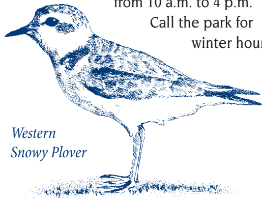
Western Snowy Plover