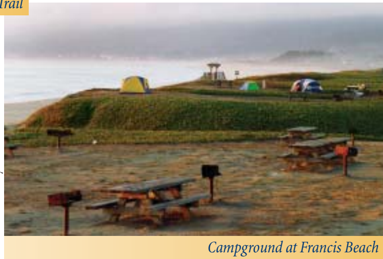
Campground at Francis Beach

Surfing conditions here are nearly impossible to forecast because of the unpredictable weather and surf action. However, depending on the direction of swell and the level of