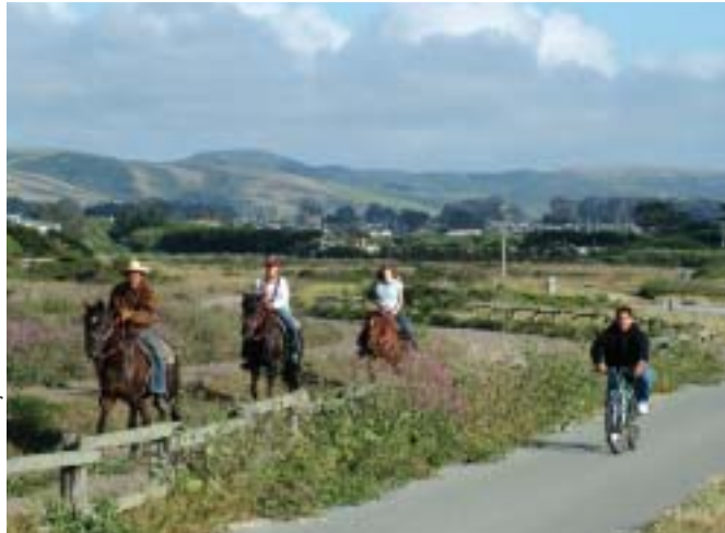
Horse trail along the Coastside Trail

Along the Coastside Trail, visitors will see California poppies, beach primroses, sand verbena, lizardtail, wild radish, mustard, coyote bush and yellow bush lupines. The bluffs and terraces of the higher elevations have been altered for agricultural purposes, diminishing the presence of the native sage scrub that once dominated the area.