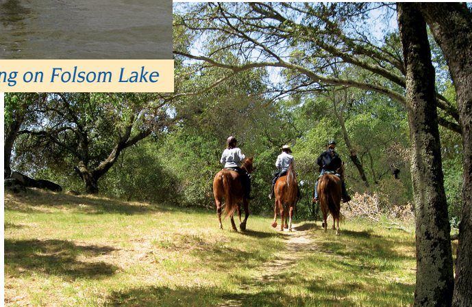
Horseback riding trails at Folsom Lake

Just north of Folsom Dam, Beals Point has 49 family campsites and 20 RV hookup sites for trailers and motor homes up to 31 feet. A sanitation station, piped drinking water, and wheelchair-accessible restrooms with hot showers are available nearby.