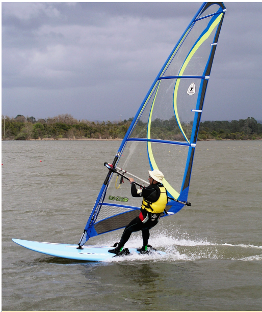
Windsurfing on Folsom Lake