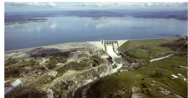
Folsom Lake and Dam