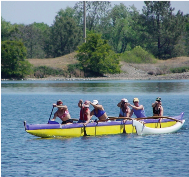
Canoeing at Lake Natoma

the Associated Students of California State University, Sacramento. For schedules, call (916) 278-2842 or visit www.sacstateaquaticcenter.com .