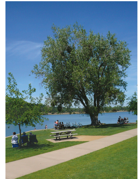
Lake Natoma accessible picnic area

The group picnic area at Granite Bay holds up to 200 people. Reserve by calling (916) 988-0205.