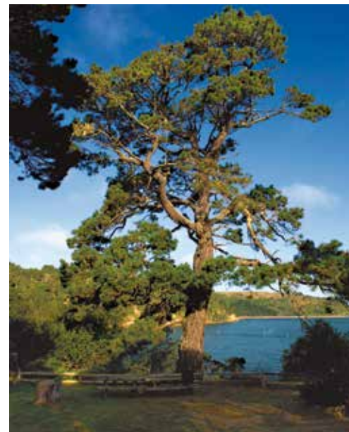
Bishop pine in the Jepson Memorial Grove

Ferns grace the wooded areas. Wildflowers brighten the countryside with splashes of vivid color during the spring.