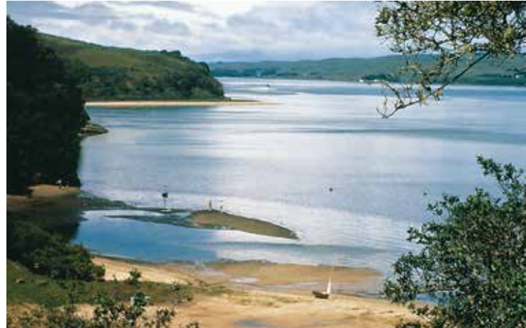
Vista Point overlook

In 1579 Sir Francis Drake laid claim to the entire area for England, naming it Nova Albion (New England). Nearly 25 years later, Spanish explorer Don Sebastian Vizcaíno named the area now called Point Reyes “La Punta de Los Tres Reyes,” after the day of the Feast of the Three Kings. “Tomales” is thought to be a Spanish inflection of the Coast Miwok word for “bay.” Most of the Tomales Bay area lay untouched until the late 1940s, when developers discovered its beauty and began to purchase beachfront land. Local residents, fearing that the