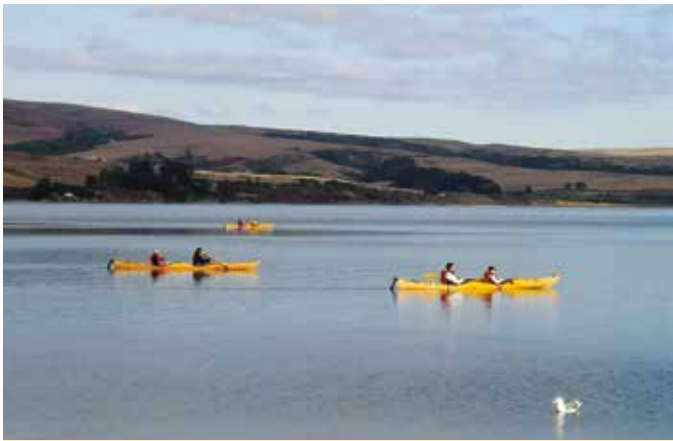
The peaceful, wind-protected beaches make this a popular water recreation area.

Water activities —Four gently sloping, surf-free beaches on the shore of Tomales Bay offer many opportunities for picnicking, swimming, hiking, clamming, kayaking, and boating. Heart's Desire Beach has a picnic