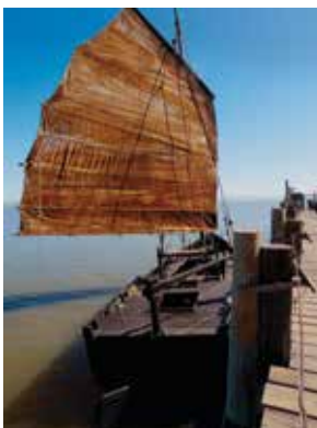
The Grace Quan

Explorer Sir Francis Drake called the Miwok “peaceful and loving” when he met them in 1579. The Miwok population declined after Mission San Francisco de Asís was established in nearby San Francisco in 1776; its sister mission, San Rafael Arcangel, was built in 1817. The mission system drastically changed the traditional lifestyle of the native people. By 1900, few were left of an estimated 2,000 Miwok just a century earlier. Today some Miwok descendants still live in the area.