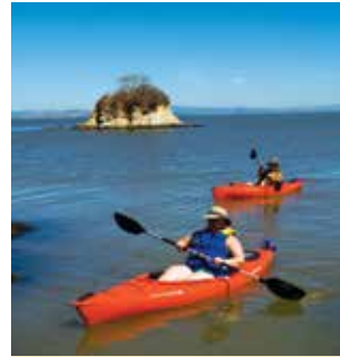
Kayaking near Rat Rock

Programs and Events —Campfire programs are held for campers from May to October. Junior Ranger programs are held by request. Heritage Day celebrates Chinese culture with activities, tours, and exhibits. The schedule is available at www.parks.ca.gov/chinacamp . School and other groups should call (415) 456-0766 in advance to arrange visits.