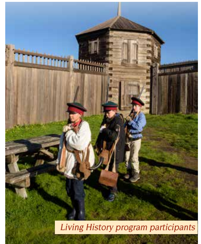
Living History program participants