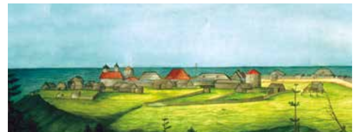
Settlement Ross, 1841 by I.G. Voznesenskii