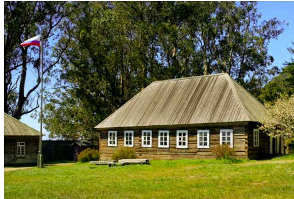
Russian flag at the Rotchev House