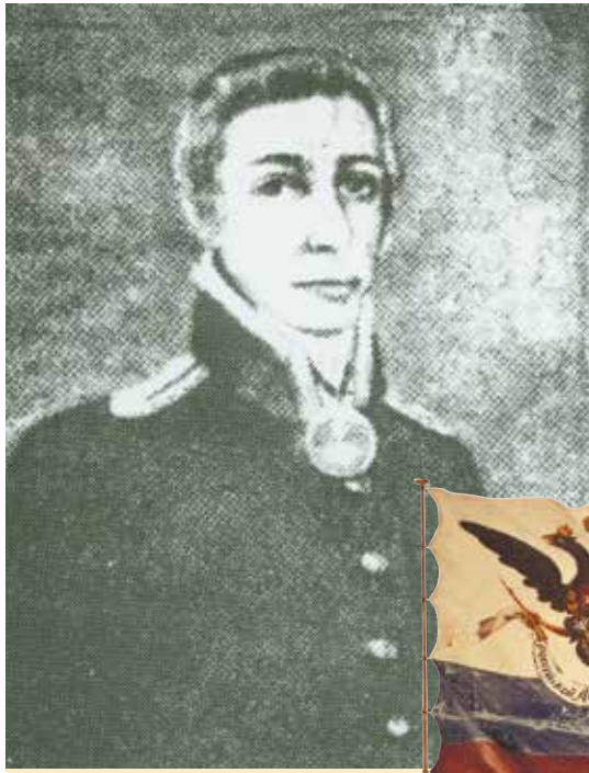
Ivan Kuskov, first manager of Fort Ross

In 1812 Kuskov brought 25 Russians and 80 Alaskans to build houses and a stockade. They established a colony to