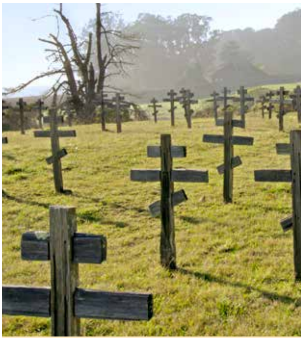
Russian-American Company Cemetery

Fishing —Abalone and rockfish usually abound in the coastal waters in season. However, there have been recent abalone closures. Check before diving.