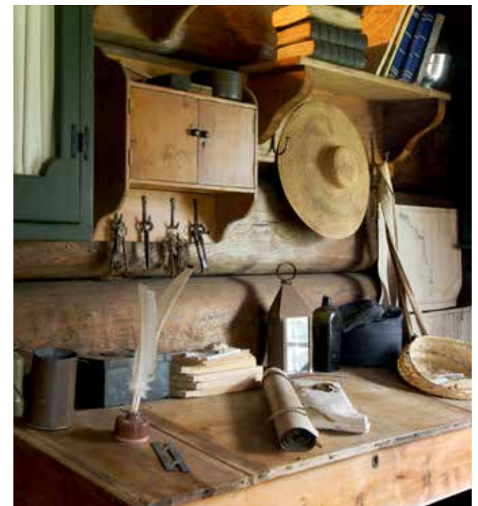
Artifacts of settlement life

The Russian-American Company's chief manager, Alexander Baranov, sent his assistant, Ivan Kuskov, to locate a California site that could serve as a trading base. Kuskov arrived in Bodega Bay on the ship Kodiak in January of 1809 and remained