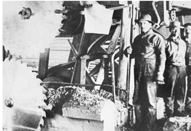
Van Damme sawmill

Van Damme habitats include marine, coastal beach, coastal bluff terrace, pygmy forest, redwood forest, and riparian, with