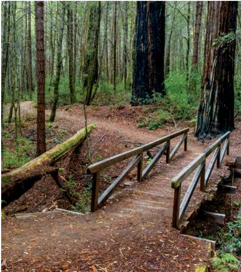
Accessible Taber Nature Trail loop

Day Use —Picnic tables and parking are available for day-use visitors.