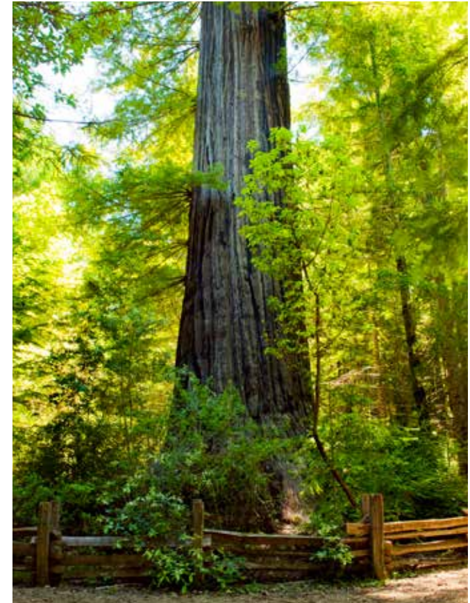
The Miles Standish Tree

Climate change also poses a threat to the park's plants and animals. Loss of coastal fog and increasing temperatures endanger the coast redwood habitat.