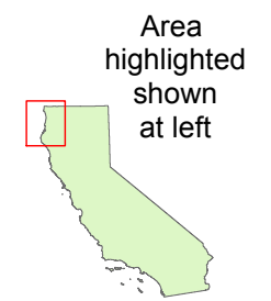
Area highlighted shown at left