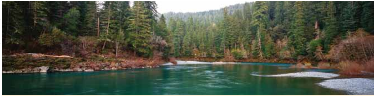
The scenic Smith River

Nevada to the Pacific coast. In 1821, at age 22, he came west and joined the fur-trapping party of General William Ashley. By late 1826, Smith and two partners had bought out General Ashley. Smith led his trappers across southern Utah, Nevada, Arizona, the Mojave Desert and Cajon Pass to Mission San Gabriel, where they rested for two months.