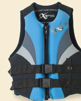
Vest-Type Flotation Jacket