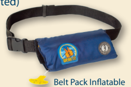
Belt Pack Inflatable

Most boating accidents involve falls overboard, capsizing or sinkings. A properly fitted and correctly used life jacket can save your life.