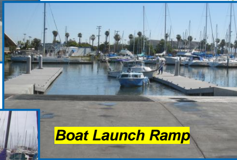
Boat Launch Ramp