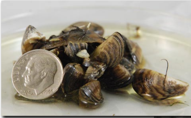
Zebra mussels next to dime.

Quagga/Zebra mussels vary in color and often have dark and light stripes on their shells. They differ in size, from microscopic young to adults an inch or two in length. These invasive mussels cluster in huge colonies.