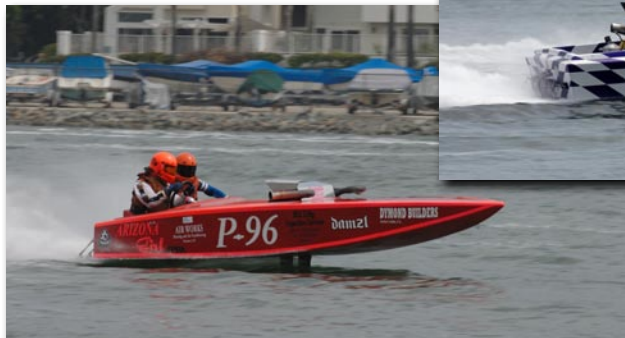
Don't Move a Mussel!