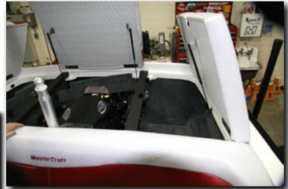
Ski boat covers open.