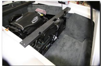
Ski boat ballast water lines.