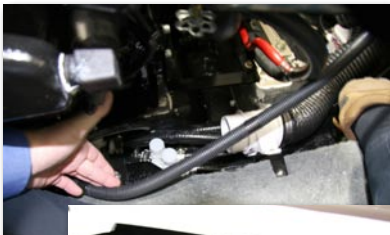
Ballast system water pump, water lines, and caps should all be flushed and cleaned.