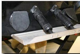
Trim tabs on transom.

Follow these actions to stop mussels from growing inside the entire system. Failure to do so could result in restriction of water lines, overheating and pump damage, as well as the increased likelihood of needing to replace expensive system components.