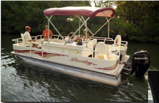
Southern California Marine Association

All areas that can hold water should be drained and dried. Pontoons should be inspected for mussels, settlers, and aquatic weeds that may have mussels attached.