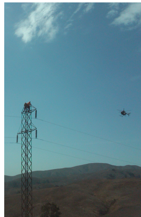
Crews worked diligently at Chino Hills SP to remove 44 power line towers.

Finally, in December 2009 the California Public Utilities Commission (CPUC) concluded the preferred route would be