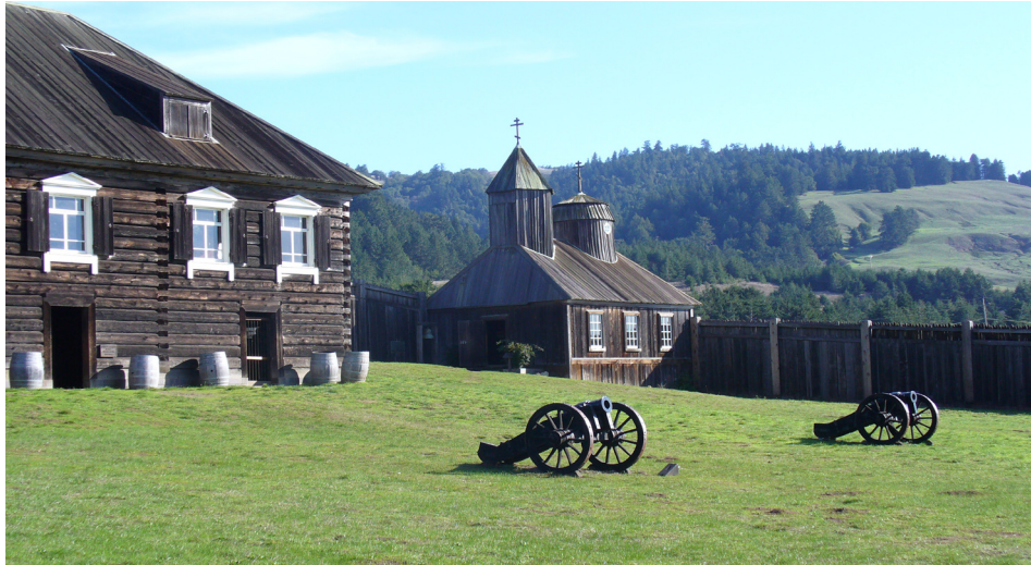
Renova commits to helping retain the beauty of Fort Ross.