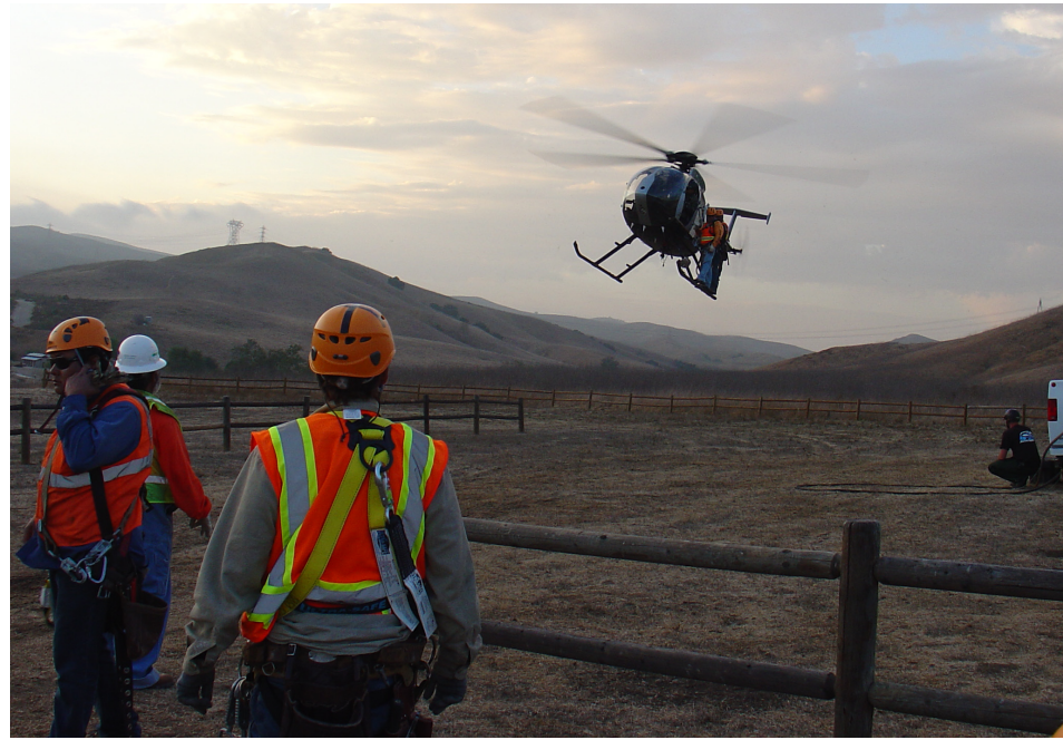
In order to maintain environmental integrity with the park, crews used a helicopter.

By Ron Krueper, District Superintendent, Inland Empire