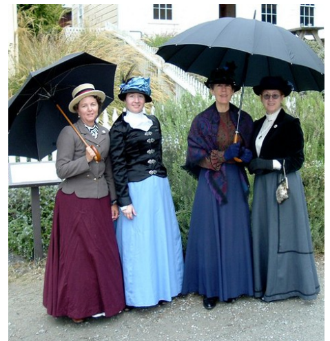
Left: Re-enactors lounging in the Parlour; Right: Ladies dressed in attire of the time take a break from displaying hand-crank sewing machines.

Rainy weather moved most activities indoors to the Bake House and Quarters 10 buildings at Camp Reynolds, which was an actual deployment site for soldiers being sent to the Philippine theater. Those park visitors that braved the rain and wind were given an enthusiastic look at life here in the years 1899 to 1902.