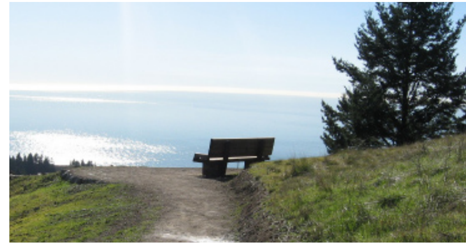
The dedicated bench at Old Mine Trail, which faces the Pacific Ocean nature. From this USA Today story came a quote that seems to put the calming effects of nature into perspective. One of the program members said, “You can see their whole attitude change.”

Other reports are also citing the healing effects of the quiet surroundings of nature. USA Today reported on a group of veterans who are finding healing in such outdoor activities as hunting and fishing, activities in places that take the mind away from the physical and mental wounds and the hospitals and sterile rehabilitation centers, and into the therapeutic embrace of