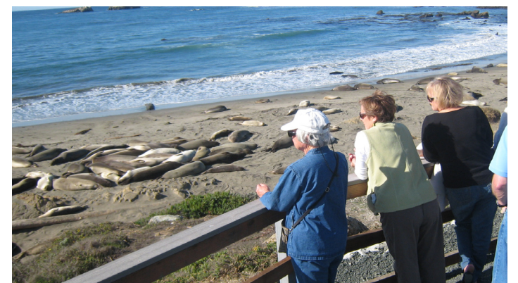
Left: Año Nuevo SP-Elephant seals begin the ritual of competing for the females. Right: Hearst-San Simeon SP-Visitors to the elephant seal boardwalk enjoy the sights and sounds of the sub-adult males returning to the beach. The big bulls will come later.