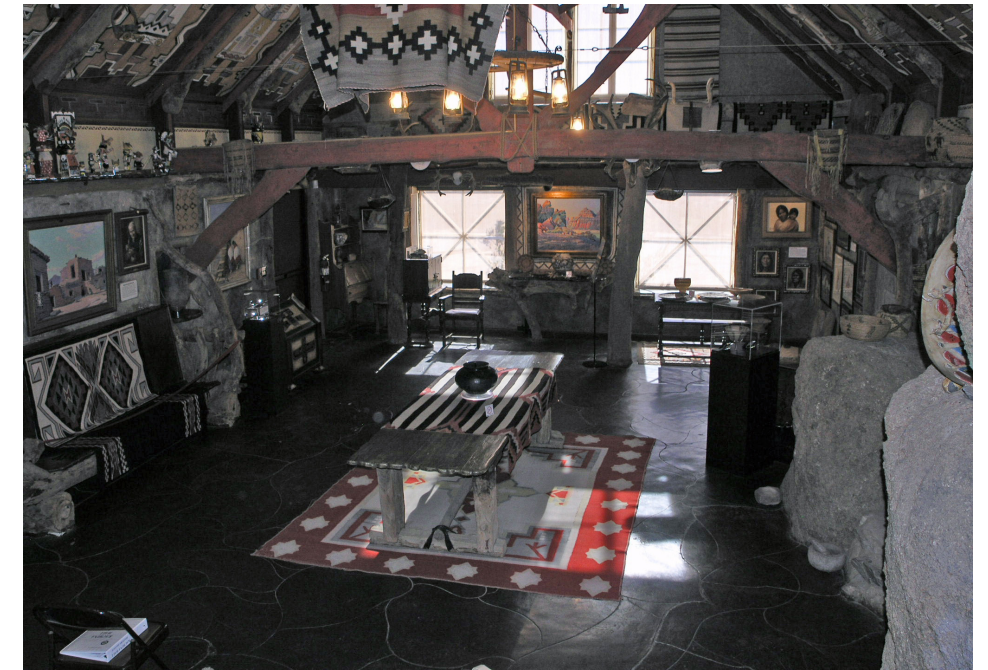
An inside view of Antelope Valley Indian Museum SHP.

The Friends of the Antelope Valley Indian Museum board members helped plan the event, provided the beverage booth and the chairs, and sold