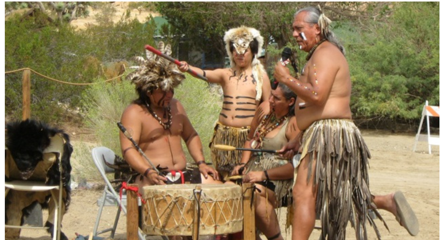
Simunu Dancers sang and danced to Chumash songs.

run the beverage booth. State Parks employees from across the Tehachapi District prepared the grounds before the event, kept it clean and safe during the event, managed the parking, sold tickets, and ran the gift shop.