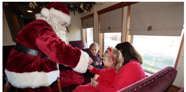
Seen here is the Polar Express™ train ride series at the California State Railroad Museum in Old Sacramento SHP, which runs Thursdays through Sundays on December 1-5, 8-12, and 15-19.