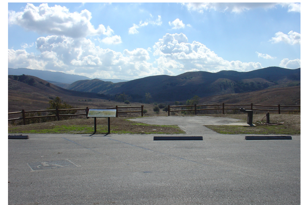
With oversight from Parks and Southern California Edison, Chino Hills SP is now free of power lines. At bottom are the before (left) and after (right) photos of the Lower Aliso Canyon Overlook.