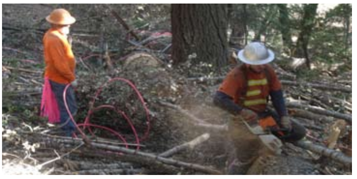
Above: Sawyers begin cutting logs into bundles according to weight.

Above: K-Max Helicopter at Silvercrest parking lot.