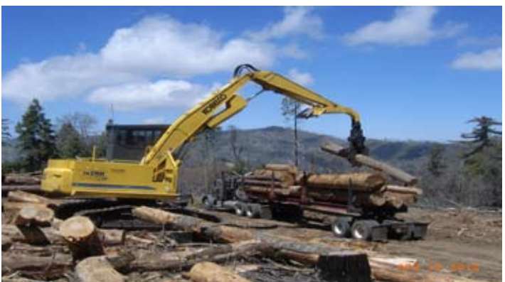
Above: Heal boom log loader and log truck.