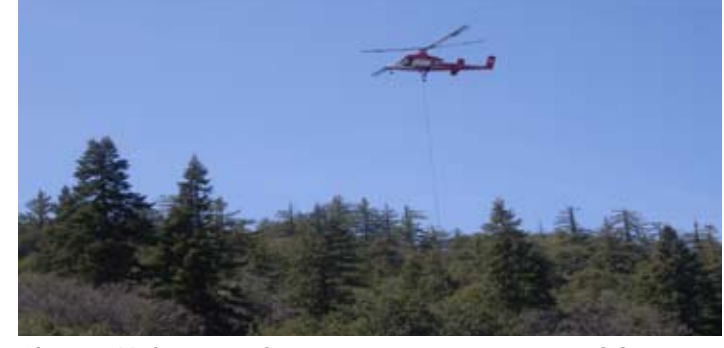
Above: Helicopter hovering over a section of forest.