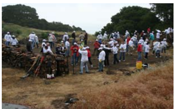
Above: Volunteers formed several long chain-gang lines and stacked dozens of cords of wood.

They came to work, and work they did. That comment sums up the efforts of the more than 300 tourism industry volunteers who went to Angel Island State Park on June 4 to help out where the parks' budget dropped out.