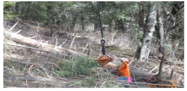
Above: Snapping choker ends onto carriage.