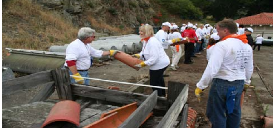
Above: Volunteers helped preserve and protect historic roof tiles by moving them to safekeeping in storage containers.

From Page 1 They have been to such places as Ellis Island, Mount Vernon and New Orleans. This year, they decided to select a site on the West Coast for assistance, that site being Angel Island. Now your first thought might be that these folks are getting on board a tourism junket where they can visit nice places, do a little work, get some public relations pictures, sip some wine, and call it a day. Not so; the evidence all day long on Angel Island showed clearly that these folks came to roll up their sleeves and work. And here's a little shocker.