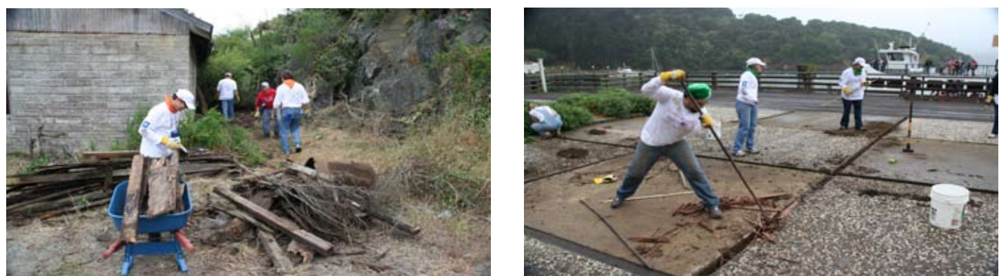
Left to Right: Behind one of the Fort McDowell buildings, the debris from a collapsed shed was removed and the site cleaned up; One of the key jobs undertaken by the volunteers was the replacement of the wooden strips within the concrete walkway at the entrance station for the park.

It is fitting that we close this article by saying that on behalf of all of us at California State Parks, we offer a major thank you to Tourism Cares for helping our system in a time of need. This is public-private partnership help at its best.