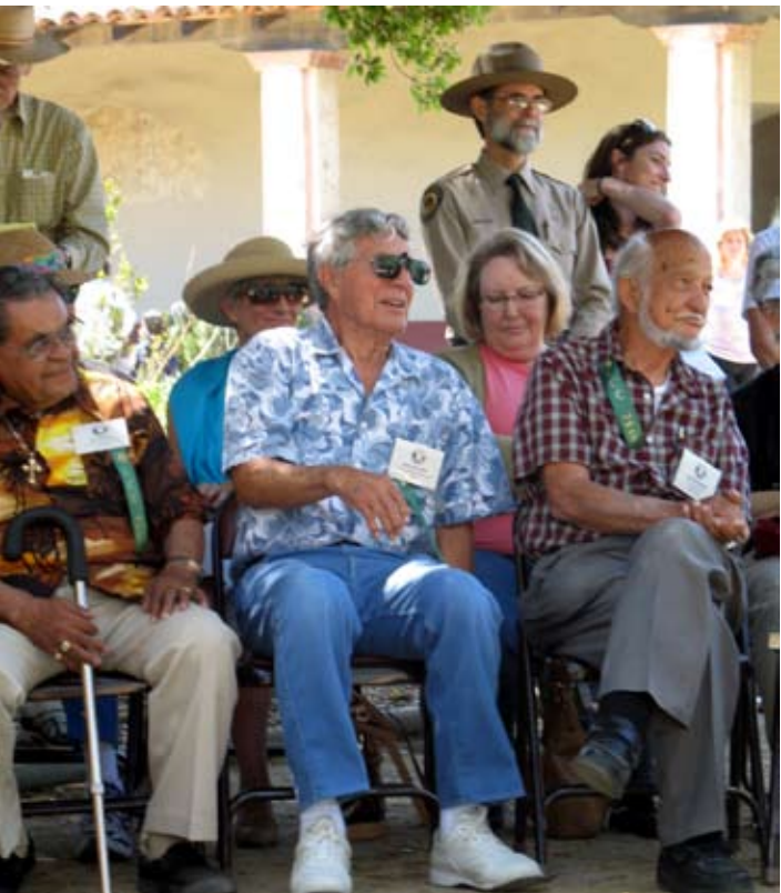
Top: Historic Photos. Bottom: Former Corps members and their families at La Purísima Mission State Historic Park.