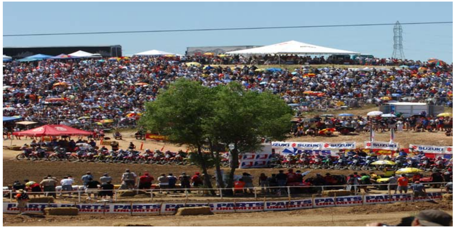
Prairie City State Vehicle Recreation Area: What does a crowd of nearly 30,000 people look like? Here's a picture of one small section of the crowd that had great fun at what is now the largest outdoor sporting event in all of Sacramento County.