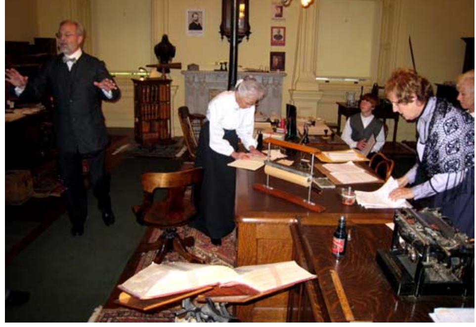
State Capitol docents re-enact events in the Secretary of State office

Living History programs help us to remember past events and give us an understanding how our heritage was formed. The State Capitol docents