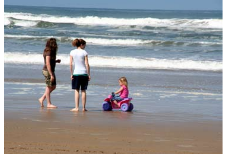
Pismo State Beach will be the new home of the Grover Beach Lodge.

This opportunity to develop and operate a lodge and conference facility concession is the result of a Joint Powers Agreement between the