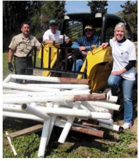
Will Rogers staff and volunteers

On April 4 and 5, two wellknown families joined forces to do some spring cleaning at one of California's most cherished homes.