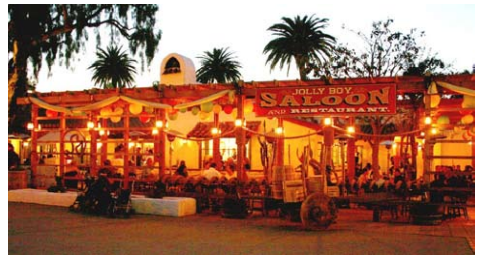
The newly-renovated Jolly Boy Saloon in Old Town San Diego.

The renovation of the Jolly Boy marks the completion of the first part of an $18 million program of improvements being carried out by Delaware North in Old Town State Historic Park.