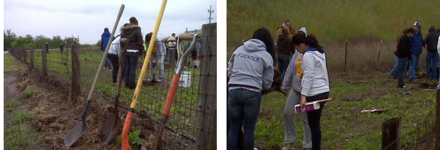
Irvine Finch Earth Day project: Hamilton City High School volunteers.