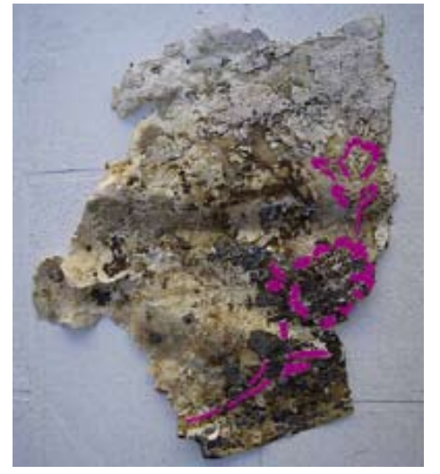
A wallpaper remnant with the floral pattern enhanced.

It is hard to know exactly what happened in this doorway. What was that black dusty layer? Was it mold seeping through the adobe bricks? Could this be the reason why the wallpaper was whitewashed over? The archaeologist's task is to listen to what the walls have to say.