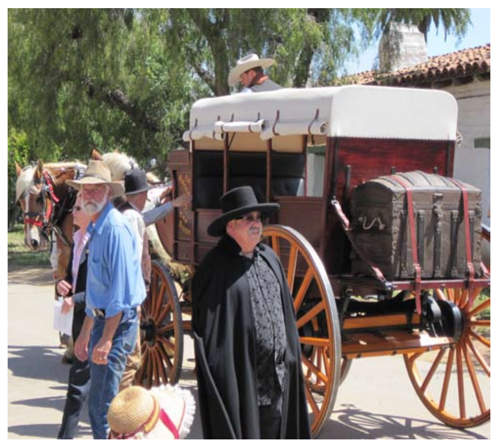
A replica of the kind of stage coach that made regular stops at the Juan Bandini building. This is a regular part of the historic recreation at Old Town San Diego State Historic Park, a gem in the park system.

The newly renovated hotel lobby. There are 10 rooms open for public use, with furnishing and decorations that date to the mid-1800s. Beds, dressers, mirrors, settees, end tables and room embellishments were found by scouring eBay and Craigslist.