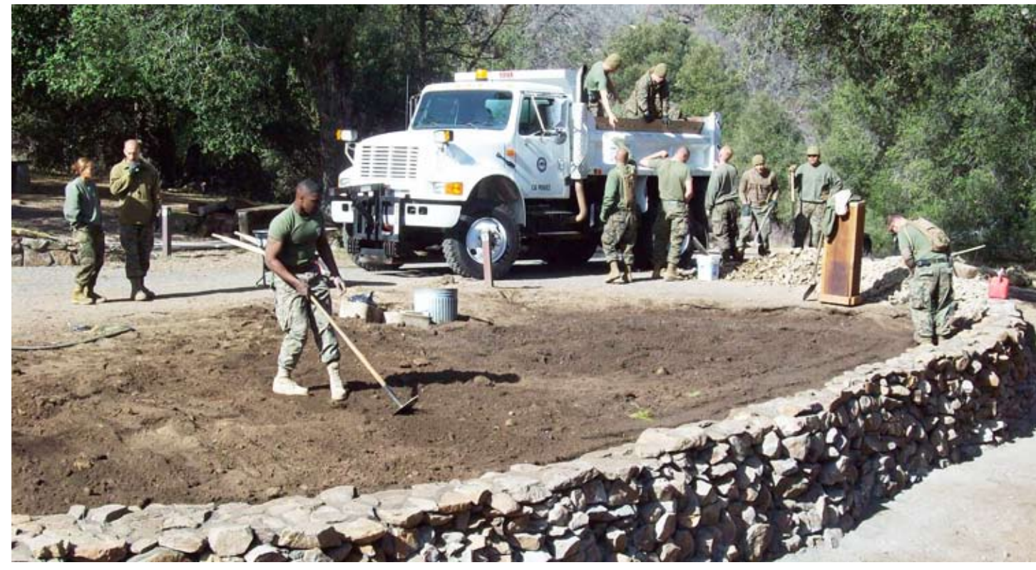
Just say the magic word: Two dozen marines and their Lieutenant felled 44 dead trees, replaced 200 cubic feet of rock wall, and cleared several miles of trail in just a week.