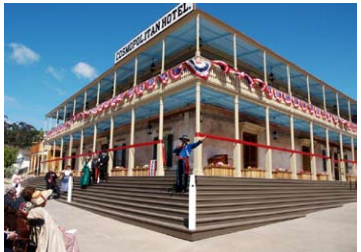
The Cosmopolitan Hotel renovations are finished after three years of work.

One of the oldest and most significant historic structures in California, the Cosmopolitan Hotel and Restaurant in Old Town San Diego State Historic Park, is getting ready for a reopening. The Cosmopolitan reopening, along with the success being generated in the Fiesta de Reyes shops and restaurants complex that reopened in the park last year, is generating a new tourism draw that is sparking a business surge for Old Town San Diego.