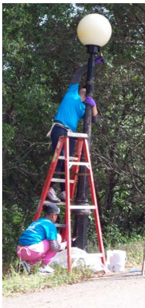
Earth Day volunteers at Folsom Lake.