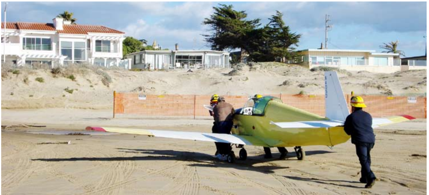
Local fire department personnel help guide the plane off the beach.

Park folks are used to dealing with off-highway vehicles, campers, boaters, people with tents and sleeping bags, those being too noisy in the camp grounds and other situations too numerous to mention. But on Monday, February 4, some of our folks at Oceano Dunes State Vehicle Recreation Area (SVRA) looked to the sky and thought..."that plane seems to be coming to our beach for a landing. What?"