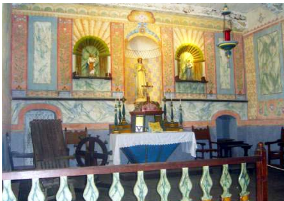
La Purísima Mission