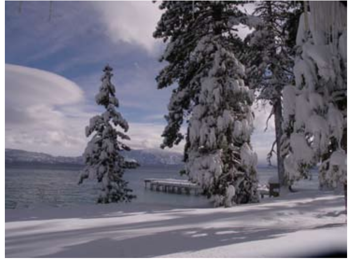
Lake Tahoe Sector Superintendent Susan Grove captured these beautiful shots in Ed Z' Berg-Sugar Pine Point State Park. The first of these photos was taken at sunrise and the second later in the day.