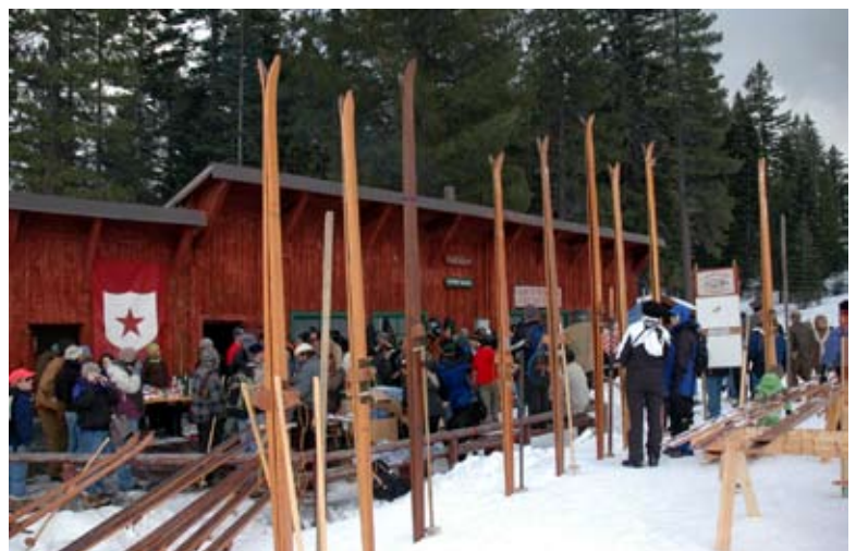
Racers and spectators gather at the historic warming hut in the shadow of the longboards.

And so, on January 20, the fifteenth year of the revived racing series began. The event was held again on February 17 and March 16. The Plumas-Eureka Ski Bowl, within Plumas-Eureka State Park, not only serves as the venue for the event, but is the likely terrain for one of the first recorded ski races in human history... Now that's living history.