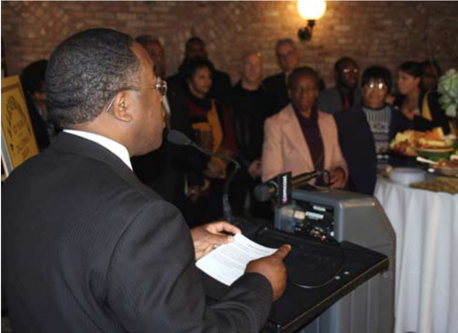
Senator Mark Ridley-Thomas addresses the crowd at the opening of the Allensworth exhibit at the State Capitol Museum.

State Senator Mark Ridley-Thomas and fellow State Senator Dean Florez officially kicked off the Centennial Celebration of Colonel Allensworth State Historic Park in a reception at the State Capitol on February 6. Both Ridley-Thomas and Florez made note of how the park had just about everything possible thrown at it over the past year, a reference to the proposal to build a dairy farm near the park that was resolved when State Parks reached a land-use agreement with the dairy farmer. However, both also said the battles of the past year brought public attention to the value of the park, with Florez saying, “This is a place where the dream still lives on.”