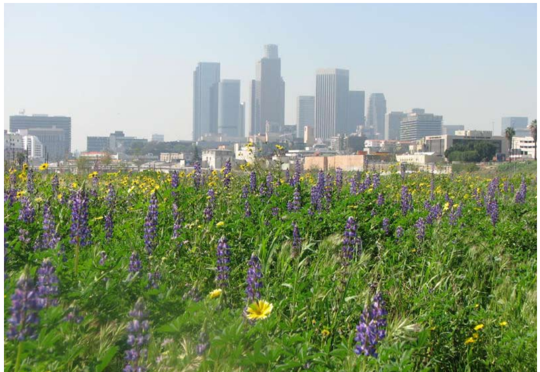
Wildflowers in Los Angeles State Historic Park, with the city in the background.