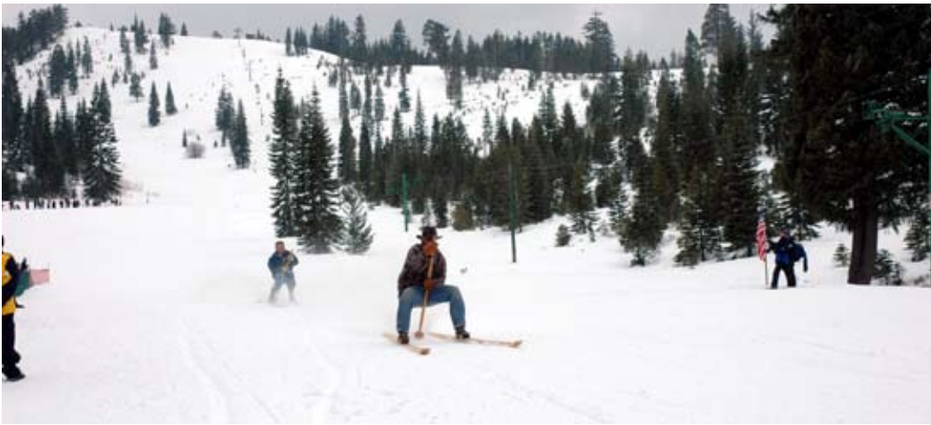
The conclusion of a men's heat; these racers are exhibiting the historical stopping method by using the single pole as a brake.

By Scott Elliott, Supervising Ranger Plumas-Eureka State Park