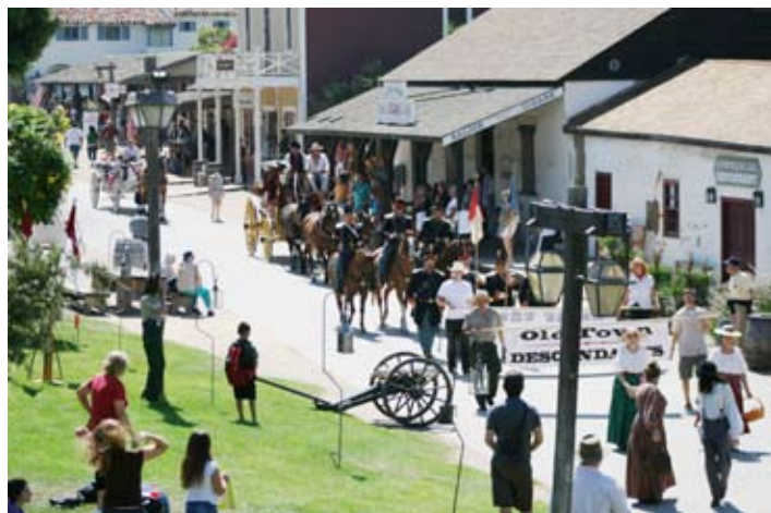
Old Town Descendants, dragons, and horse drawn wagons were part of the parade.

Telephone, email, text message—what was life like before instant communication? Can you imagine the thrill of the people in San Diego when the Overland Mail first arrived on August 31, 1857? Labor Day weekend this past year cel-