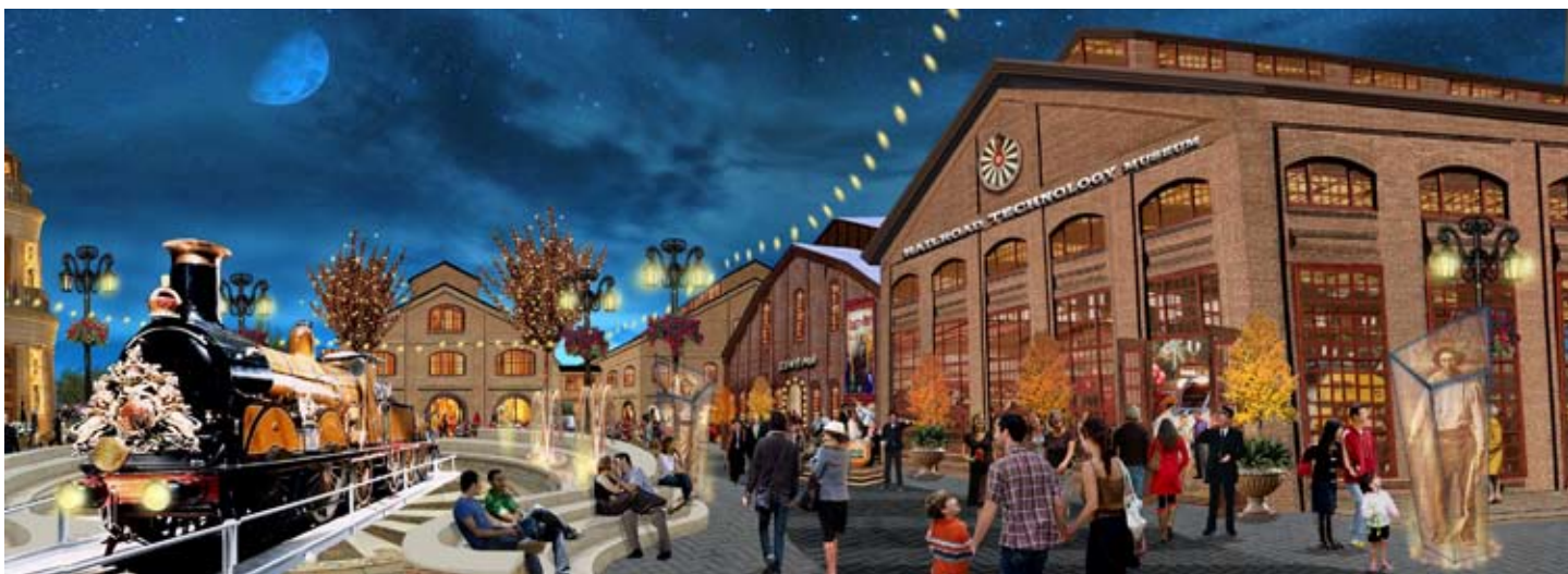
Sacramento Railyard - Artist's drawing of proposal for Railroad Technology Museum.

Gov. Arnold Schwarzenegger announced in a press release on December 8 that an agreement had been reached among California State Parks, the California State Railroad Museum Foundation and Thomas Enterprises regarding the Downtown Sacramento Railyard. As a major component of the agreement, State Parks will receive two historic buildings in the railyard, under certain conditions, for use as the new Railroad Technology Museum.