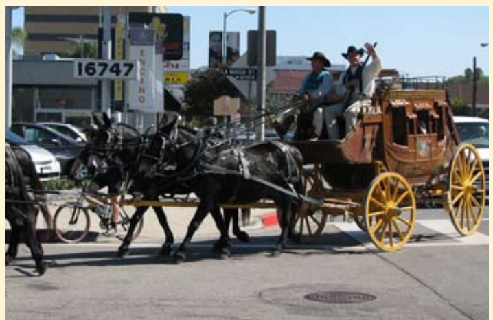
A stagecoach traveled more than 17 miles of what used to be a stage line during Los Encinos State Historic Park's Stagecoach Day.