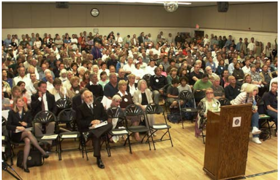
Over 1,000 people attended a 2005 meeting of the Park and Recreation Commission, most opposing the proposed toll road through the park.

The U.S. Department of Commerce on December 18, 2008, upheld the California Coastal Commission's rejection of a proposed 16-mile toll road extension that would have cut through San Onofre State Beach. According to the Commerce Department, federal officials could only override the state's decision if they found the project had no reasonable alternatives or was necessary to national security. They said neither criteria was met.