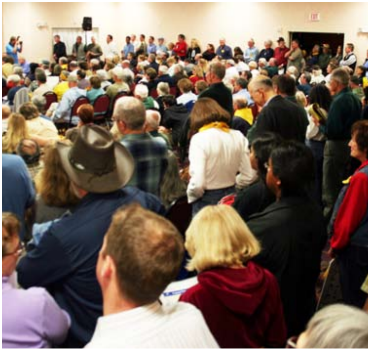
A packed house voiced their disapproval for a power line through Anza-Borrego Desert State Park during a 2007 Park and Recreation Commission meeting.

On December 18, the California Public Utilities Commission (CPUC) voted 4 to 1 in favor of San Diego Gas & Electric Company's (SDG&E) Sunrise Powerlink. However, in approving the transmission line, they chose the southern route that does not go through Anza-Borrego Desert State Park. SDG&E had initially proposed a northern route as their favored alternative. It would have gone through the middle of the park and would have required that the State Park and Recreation Commission de-list wilderness, something that has never occurred.