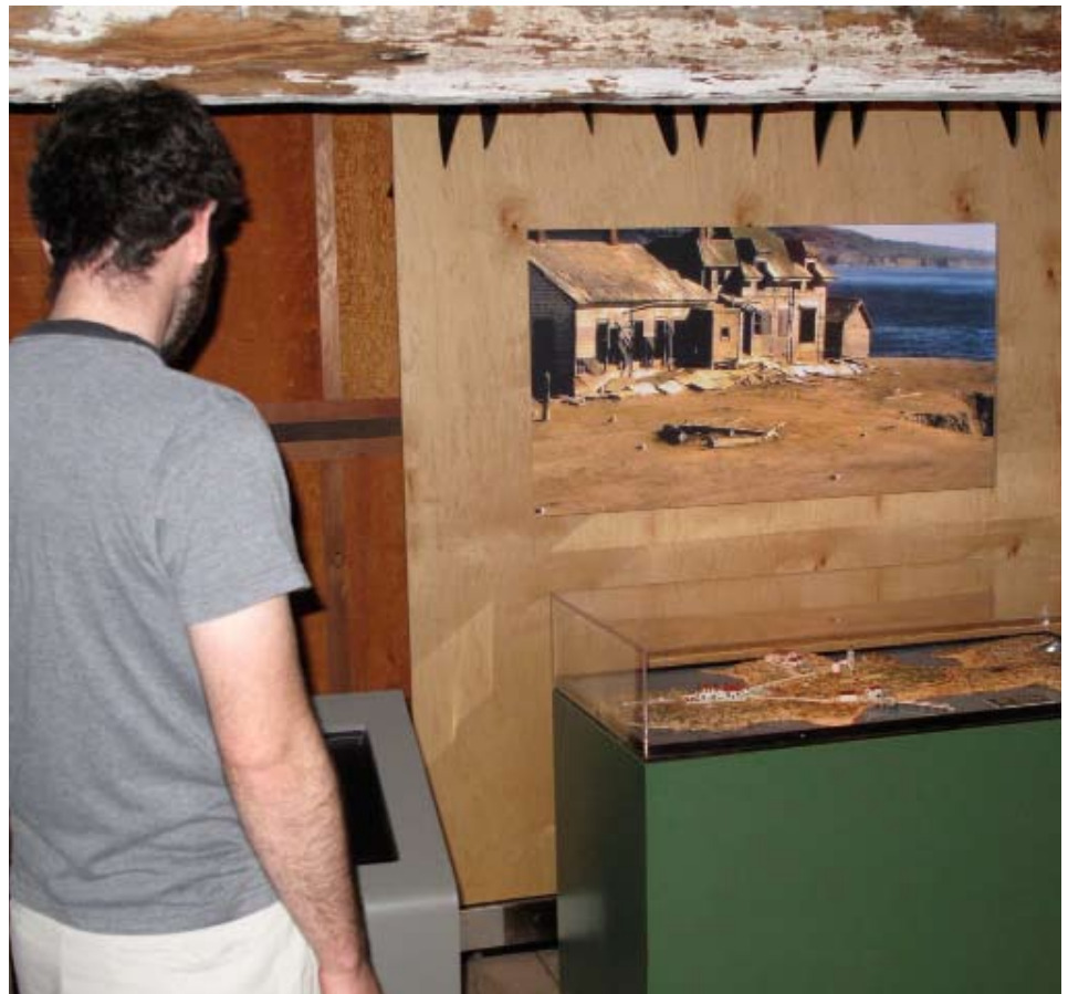
SealCam images can be viewed from visitor center or online.

The HD SealCam replaces a old low resolution webcam that was concessionaire-operated from the island for seven years. The original webcam added ambiance to the visitor center, was one of the most popular features of