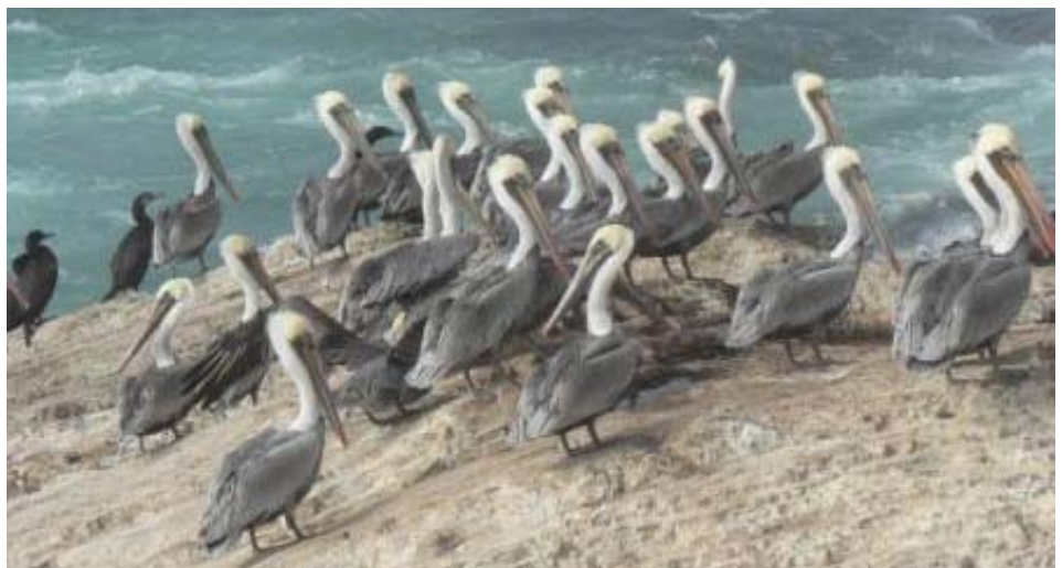
Above and Below: The new HD SealCam can pan around Año Nuevo State Reserve for wildlife counts without leaving shore.