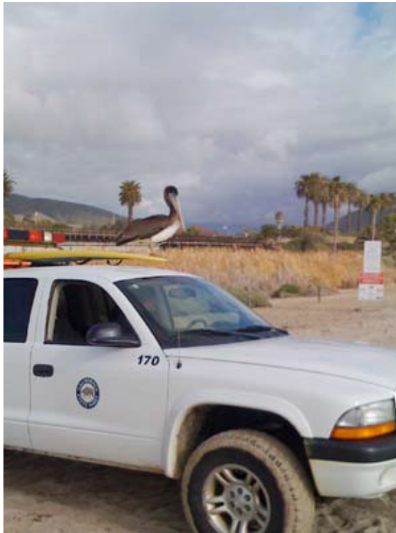
Close encounters of the pelican kind: this photo by park visitor Luis Meija was taken at San Onofre State Beach in early January.

We just read your news release of October 2 announcing the closure of Pfeiffer Big Sur State Park campground until Memorial Day 2009. Although this is unfortunate, we applaud what you are doing to preserve and protect this wonderful site in the wake of the terrible Basin Complex fires this past summer. Over the years my family and I have camped there many times, and we have appreciated the rich variety of things to see and do at Pfeiffer Big Sur. We wish you well as you remove and replace the bridges, and take other preventive measures to benefit the park. We look forward to returning sometime in the future.