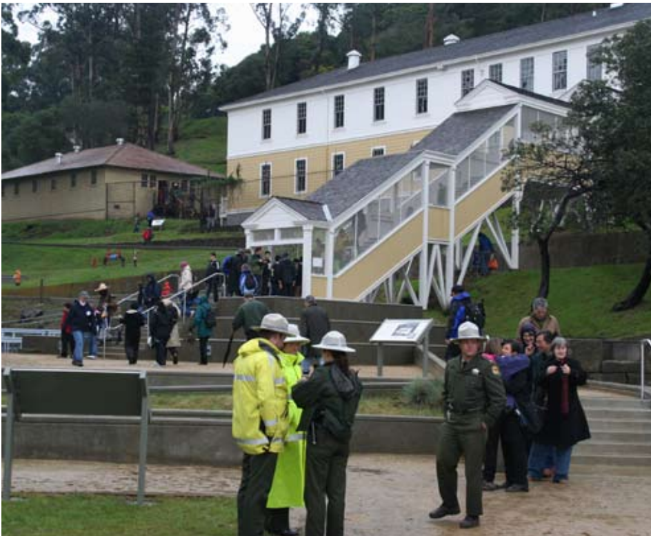
The prominent feature of the U.S. Immigration Station is the barracks building. The covered stairway was part of the phase one restoration. It was built to match the original that new immigrants used.