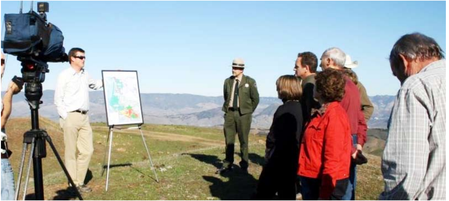
California State Parks staff, members of The Nature Conservancy, and members of the Andre family listen to a presentation on the preservation of the land donated by the Andre family.

The Nature Conservancy, California State Parks and the Andre Family came together on a hillside in San Luis Obispo County on December 5 to celebrate the preservation of 1,902 acres of ranch lands and surrounding habitat. In this preservation agreement, the Nature Conservancy purchased a conservation easement on approximately 1,172 acres and California State Parks acquired the remaining 730 acres to be added to Montaña de Oro State Park.