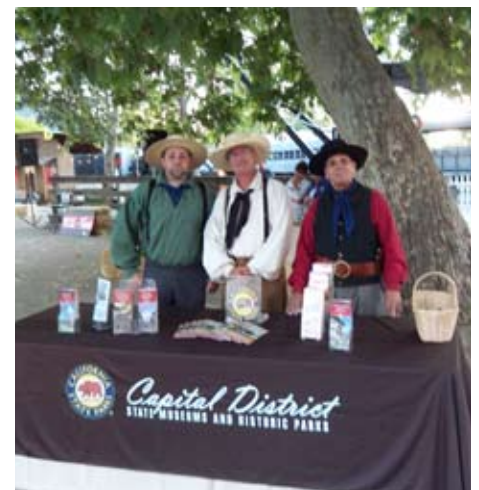
Sutter’s Fort SHP Volunteer Staff.