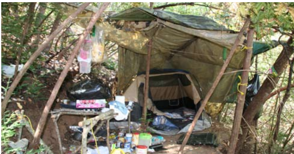
One of three campsites used by the growers.