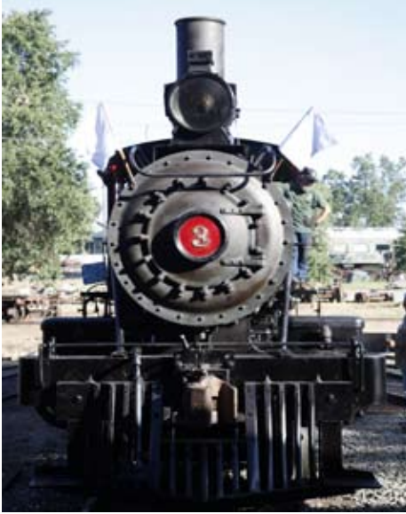
A closeup of the Sierra engine.