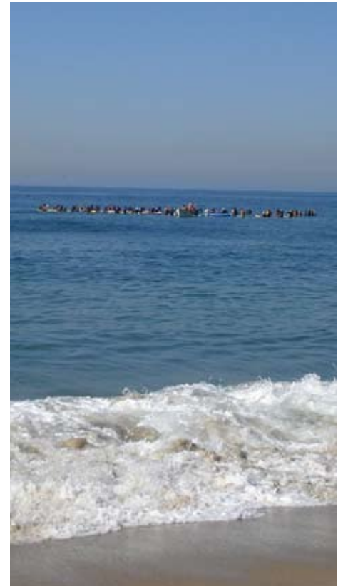
The remembrance service on the beach and commemorative paddle-out in Ron's honor drew many people.