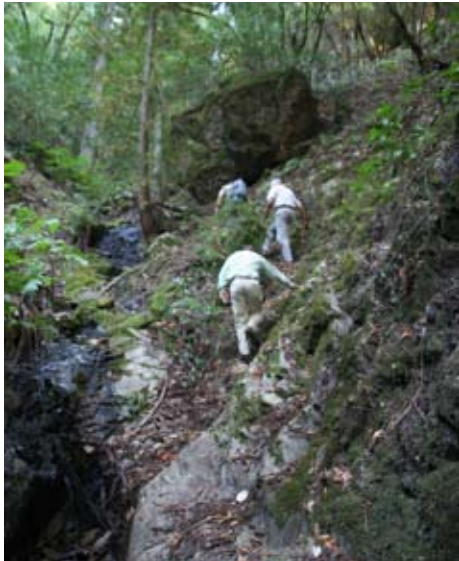
The hikers faced a difficult hike to the marijuana gardens.