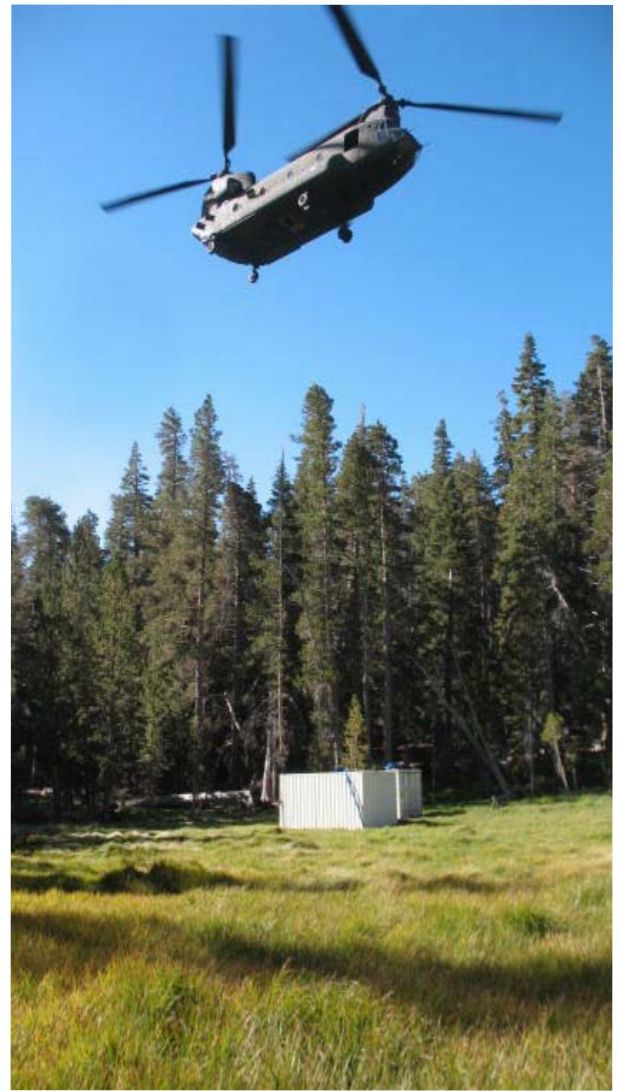
An Air National Guard CH-47 helicopter (Chinook) transported soil.

The stream channel now exists at the same elevation as the meadow surface, raising the water table back to its natural elevation. Disturbed areas are being replanted with native meadow plant stock, and the site recovery will be monitored for the next several years.