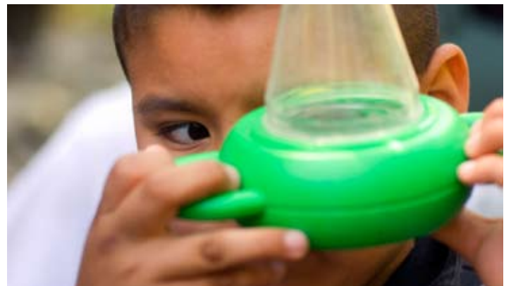
More photos from this year's Summer Enrichment pilot program. Parks shown in these photographs include Henry W. Coe State Park, Mount Tamalpais State Park and Sugarloaf Ridge State Park.