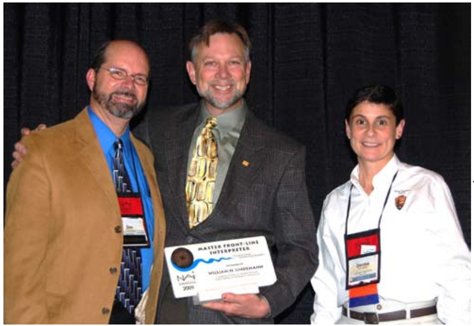
National Association for Interpretation