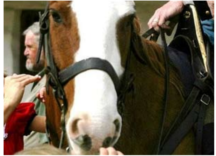
Left: The Fort Tejon Dragoons arrive on horseback at Presidio de Santa Barbara State Historic Park. Right: the horses were just as popular as their riders.

citizens in common—having equal rights and bearing equal responsibilities.”