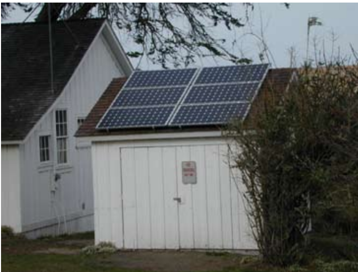
After completion, the panels were installed on top of a pump house at the Montaña de Oro State Park visitor center.

On sunny summer days when photovoltaic generation is at its peak, any excess electricity generated will flow back into the power grid. In 2010, corps members will install solar panels at several locations in Morro Bay State Park. The $190,000 project was funded by PG&E as settlement of a lawsuit brought by the Coastal Law Enforcement Action Network (CLEAN) and in addition to the solar panel installation, includes a raptor introduction program. This solar project is the latest in a series of conservation measures under the “Cool Parks” program which began in 2007. As members of the California Conservation Corps perfect their green technology skills, it is hoped that they will undertake similar Cool Parks projects in park units throughout the state.