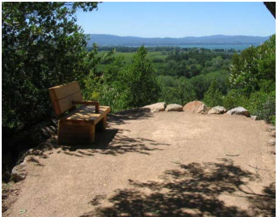
The Dorn Nature Trail at Clear Lake State Park is an example of the accessibility projects completed by the RTR Section.

Crew members who participated in recent projects include Park Maintenance Chief Don Beers (retired), who founded the RTR program;