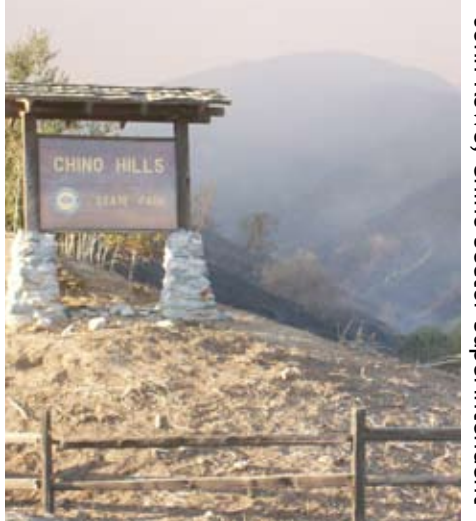
Damage was visible the day after the fire was extinguished.

The successful repair and reopening is due to a tremendous amount of dedicated hard work by Park, District, Southern Service Center and Sacramento Headquarters staff.