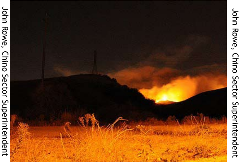
Above: More photographs of the fire from the entrance of Chino Hills State Park. Below: the city of Yorba Linda with the Chino Hills wildfire in the background.