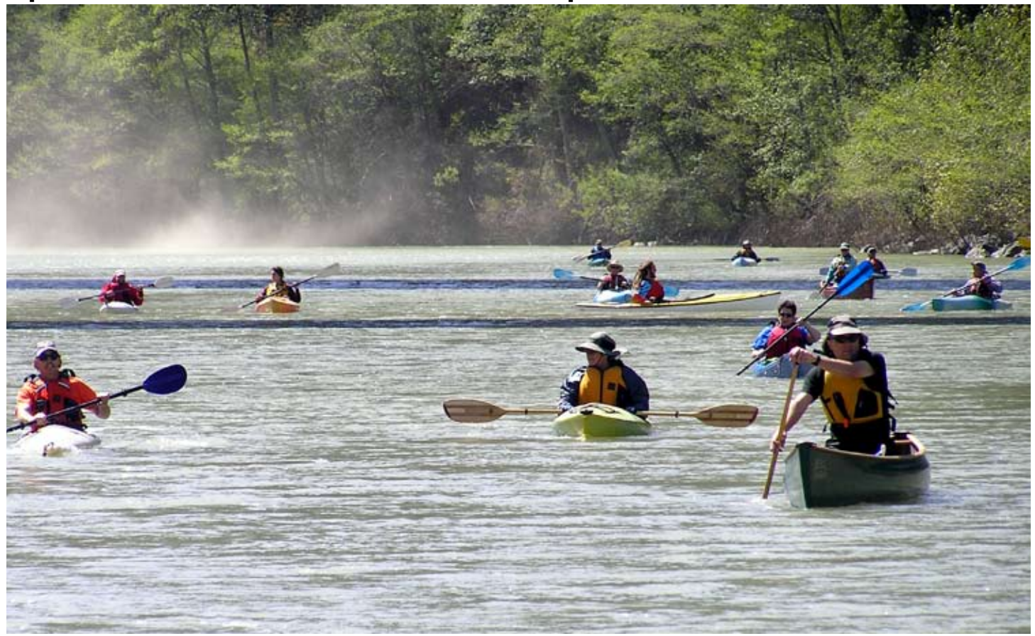
April is a popular month for Humboldt Redwoods State Park's canoe hikes, where rangers lead visitors down the South Fork of the Eel River.