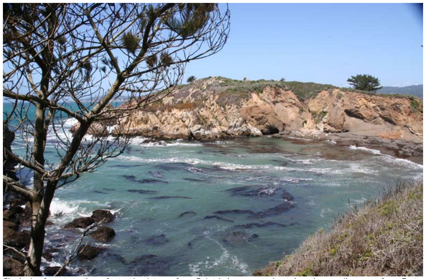
Clockwise from top: three fantastic pictures from Point Lobos, approximately a dozen miles away from Fort Ord Dunes State Park; Fort Ord Dunes State Park.