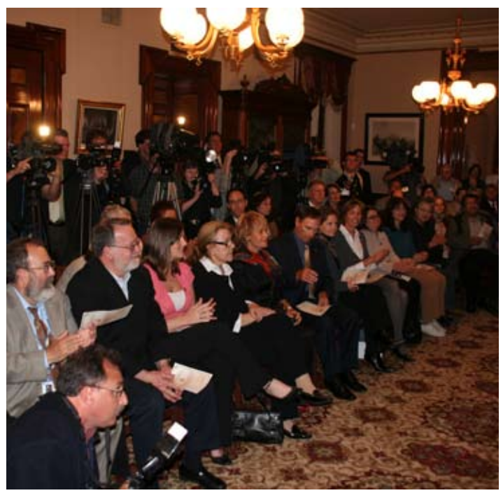
The dining room of the Leland Stanford Mansion was packed with press, staff, and guests for the event.