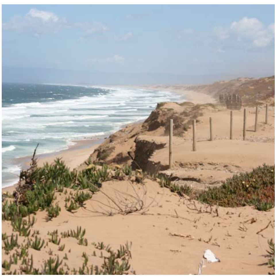
Fort Ord Dunes State Park boasts fantastic views on land previously used by the U.S. Army.