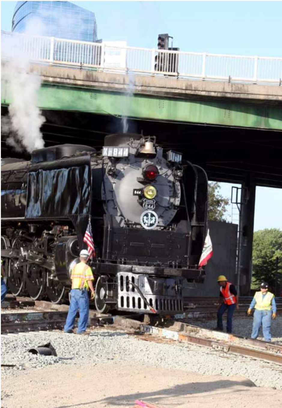
Above: Historic Union Pacific Locomotive No. 844, the last steam locomotive made for the railroad. Below: a promotional photo for the weekend-long September event.