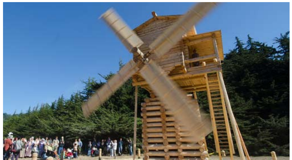
A newly constructed windmill is a replica of windmills found throughout the historic Russian Empire.

Finally, with financial help from the Russian cultural charitable organization Link of Time, the fort has a new windmill that replicates the kind used in the early 1800s. The windmill was hand-crafted in Russia, then shipped to the fort for assembly and unveiling at the Harvest Festival.