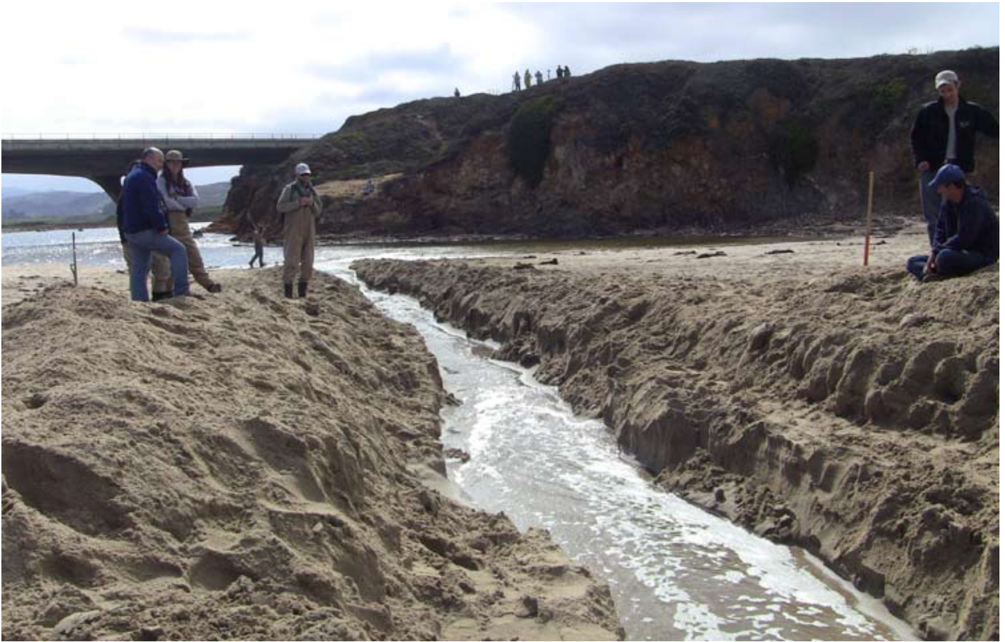
Volunteers and youth from Santa Cruz County Juvenile Hall hand-dig a breach to allow water flow between the ocean and the Pescadero Marsh.

Federal agencies and California State Parks are partnering on a project to avoid fish kills of threatened species at Pescadero Marsh Natural Preserve. The National Oceanic and Atmospheric Administration and the U.S Fish and Wildlife Service agreed to a manual breach of the seasonal sandbar at Pescadero Lagoon. The project is an effort to prevent a fish kill this year and to learn more about how the lagoon system works. The goal is to gather data to better inform future decisions for the long-term management of the system.