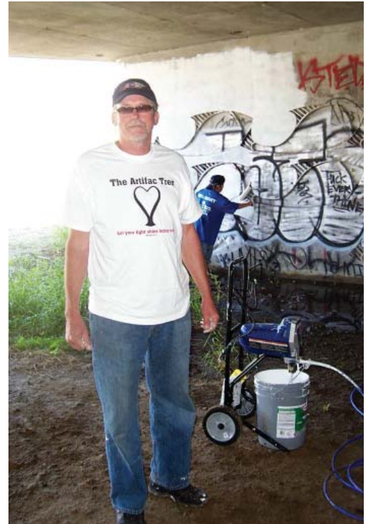
Employees of The Artifact Tree in Malibu donated their time to help their town.

The Artifact Tree was the only Malibu business to show up and accounted for the only two citizens of Mali- bu in attendance! The Artifact represented well! The volun- teers from the Artifact took on the giant task of assembling a new airless paint sprayer that was generously donated by the State Parks Founda- tion as well as the Malibu Creek Docents, and painting years of