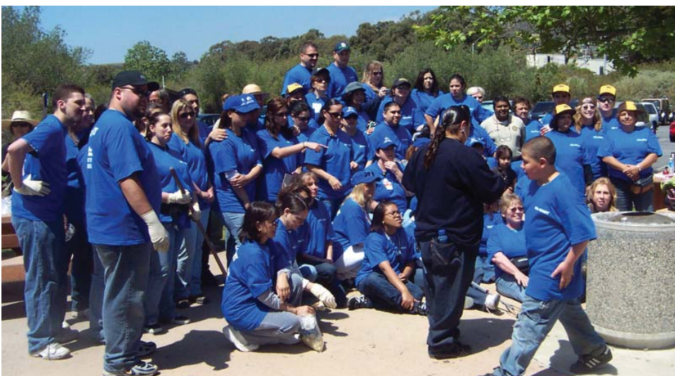
Volunteers from local Wal-Mart stores provided three quarters of the labor for the Malibu Lagoon State Beach Earth Day Cleanup.

Many thanks go out to Wal-Mart, Edison of California, The Malibu Creek Docents and the California State Parks Foundation.