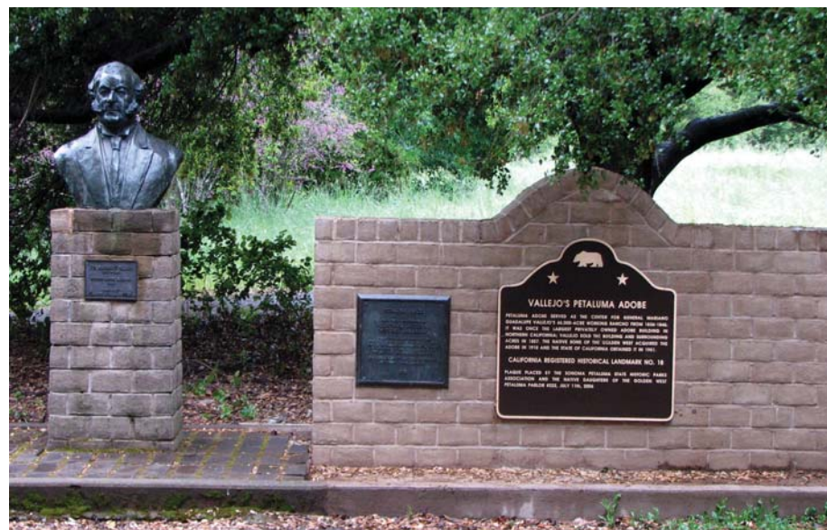
A new plaque and wall introduce General Mariano Vallejo's Petaluma Adobe with accurate information.

In January 2005, the Native Daughters of the Golden West stepped forward with a fundraising effort and by sum-