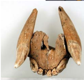
Left: This lower jaw of a grizzly bear found during excavation of the Cooper-Molera Adobe in Monterey. It was found with ceramic items that date the jaw to the 1830s-1840s. It may have come from the loser in one of the bull and bear fights common to Mexican California.

News & Views Needs Your Stories! E-mail newsandviews@parks.ca.gov