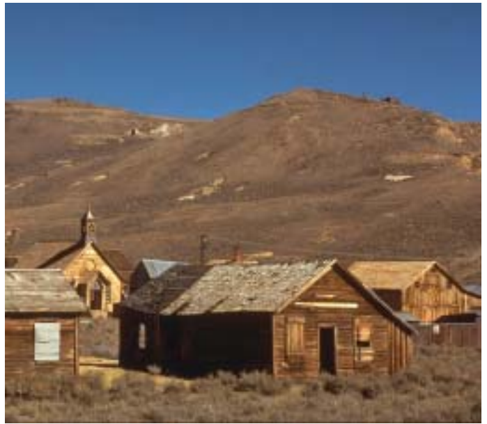
The historic ghost town of Bodie State Historic Park

Our core programs are the major activities that encompass the mission of the department. They include Natural Resource Protection, Cultural Resource Protection, Facilities, Interpretation/Education, Public Safety and Recreation. Each core program can be defined by measurable outcomes that encompass the essence of California State Parks' legal mandates as defined in statute and articulated in the mission of the department. Part II of this publication is divided into core programs, providing analysis of data in outcome measurement terms.