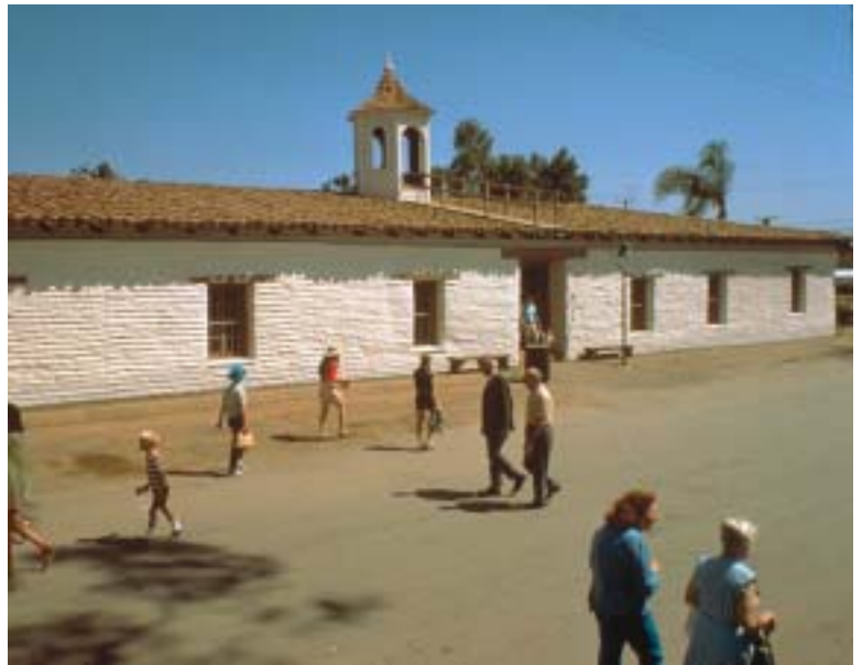
Old Town San Diego State Historic Park

As California moves into the 21 st century, California State Parks will reaffirm its role as the recognized leader among park, recreation and resource management service providers. The Department will provide clean, well-maintained grounds and facilities that are inventive and inviting. The Department will strengthen its bond with traditional partners and seek new partnerships as a way of connecting with all Californians. Cutting edge technology and best management practices will be used to increase the Department's efficiency and broadcast the message of park opportunities to all Californians.