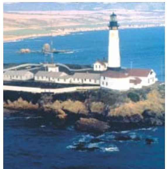
Pigeon Point Lightstation State Historic Park

Continuous Improvement and Innovation —We believe that our system of service delivery can always be improved, and we will work at effecting that improvement. We conduct business efficiently and economically.