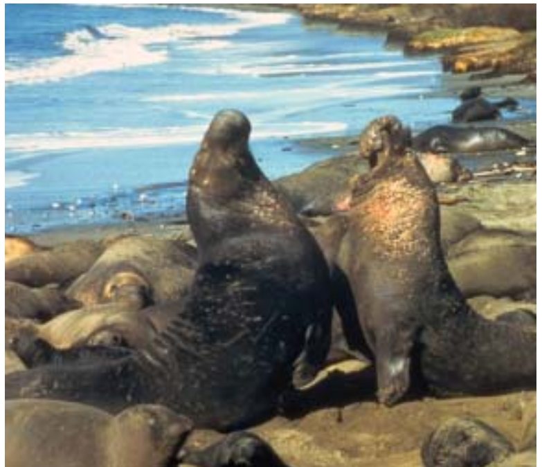
Bull elephant seals at Año Nuevo State Reserve

“ Performance Targets ” are the expected or anticipated levels of performance.