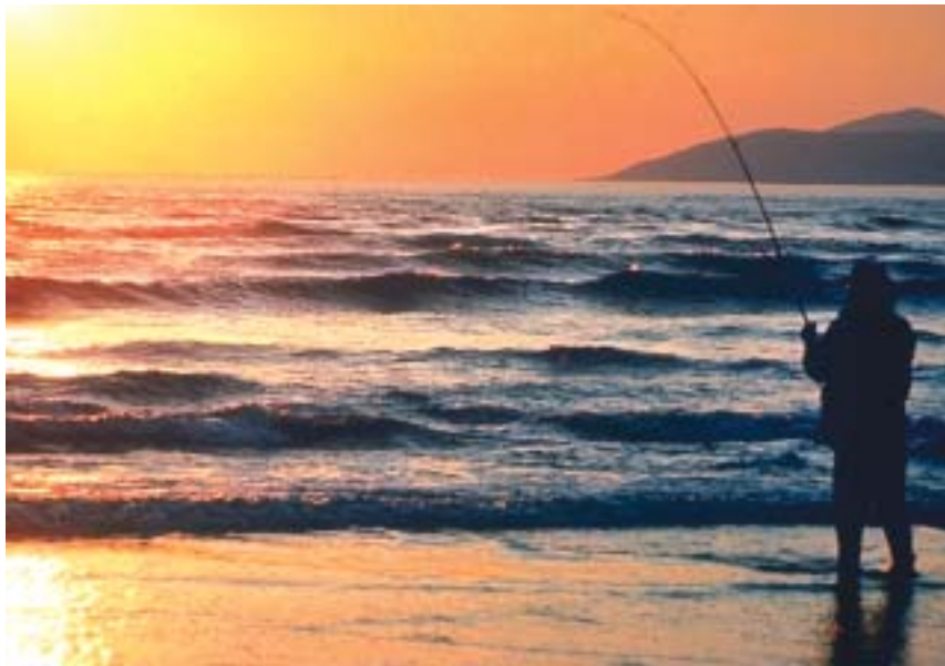
Sunset fisherman at Pismo State Beach

The following report clearly outlines the mission, core programs, values, vision, and outcomes of California State Parks so that there is a common understanding of the future to which state parks aspires.