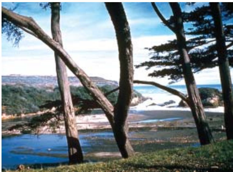
Montaña de Oro State Park

The mission of the California Department of Parks and Recreation is to provide for the health, inspiration, and education of the people of California by helping to preserve the state's extraordinary biological diversity, protecting its most valued natural and cultural resources, and creating opportunities for high-quality outdoor recreation.