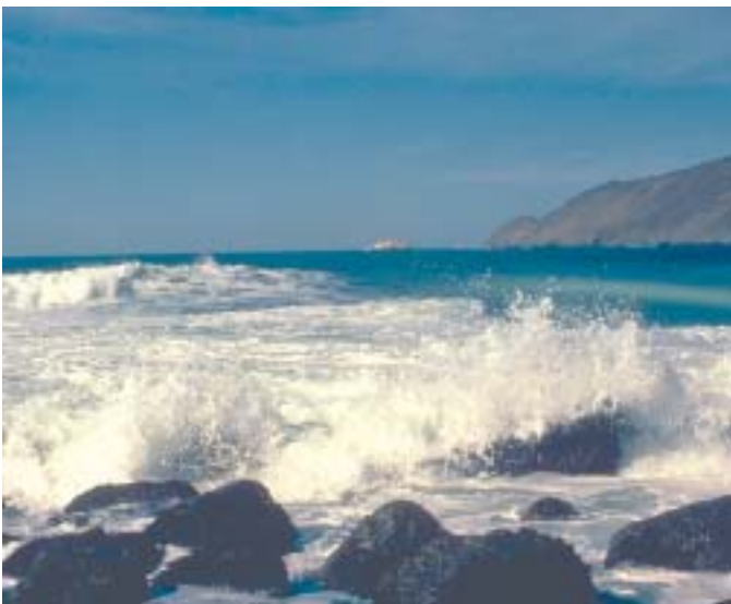
Rocky coastline at Point Sal State Beach

Expand Recreational Opportunities —Provide additional outdoor recreation opportunities to keep pace with the needs of California's growing, diverse population and changing lifestyles.