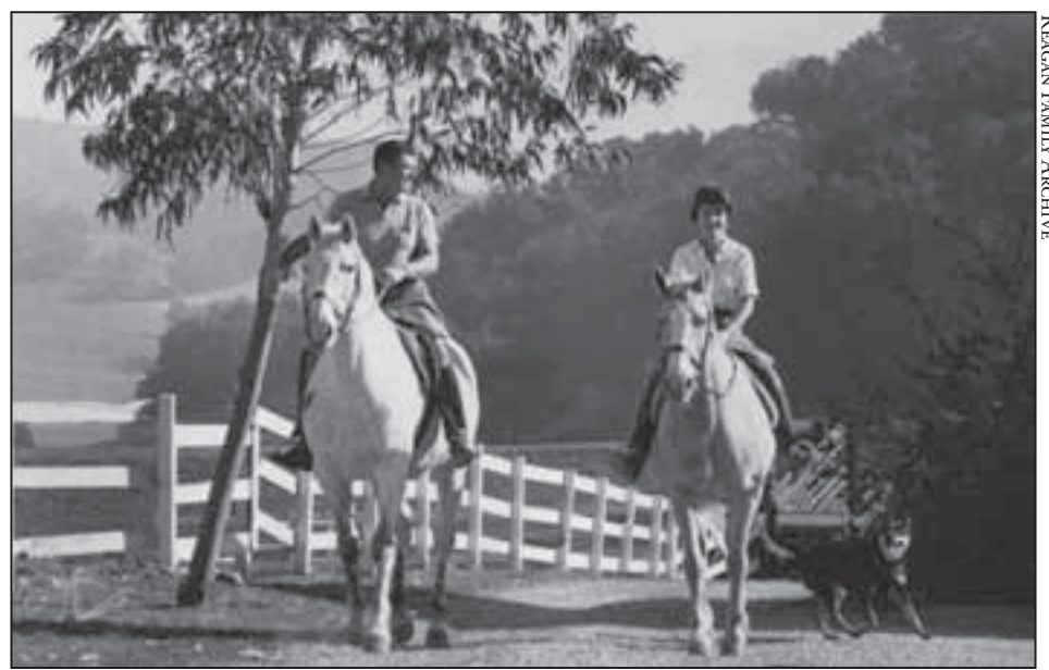
Ronald and Nancy Reagan riding on property that is now part of Malibu State Park.