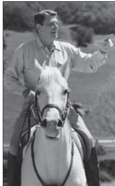
Reagan's partner of many years was the gray Anglo Arabian El Alamein.