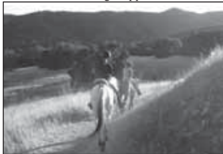
From the Ronald Reagan Equestrian Campground, riders will have access to more than 700 miles of trails.