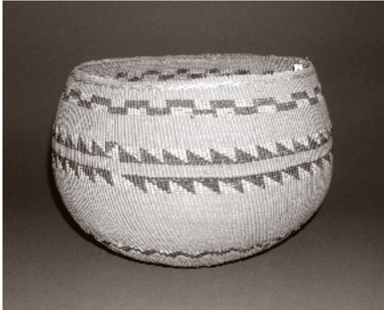
Cooking basket (Pomo). Conifer root and redbud. Collected by E. S. MacCallum, c.1885. Catalog No. MCC-21-55-S.

—dyed and undyed—and include overlay of phragmites and/or bear grass. Within this group of baskets are approximately sixty-three caps, revealing a wide range of designs. It appears that the Astarawi may have made two types of caps—dress and work styles—similar in nature with the dress/work style caps made throughout Northwestern California.