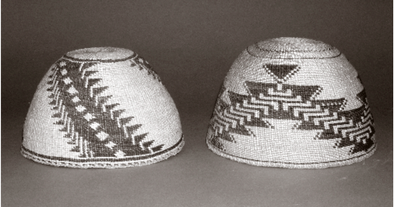
Women's dress caps (Astarawi). Collected by Mae Helene Bacon Boggs. Catalog Nos. 47001 and 47011.