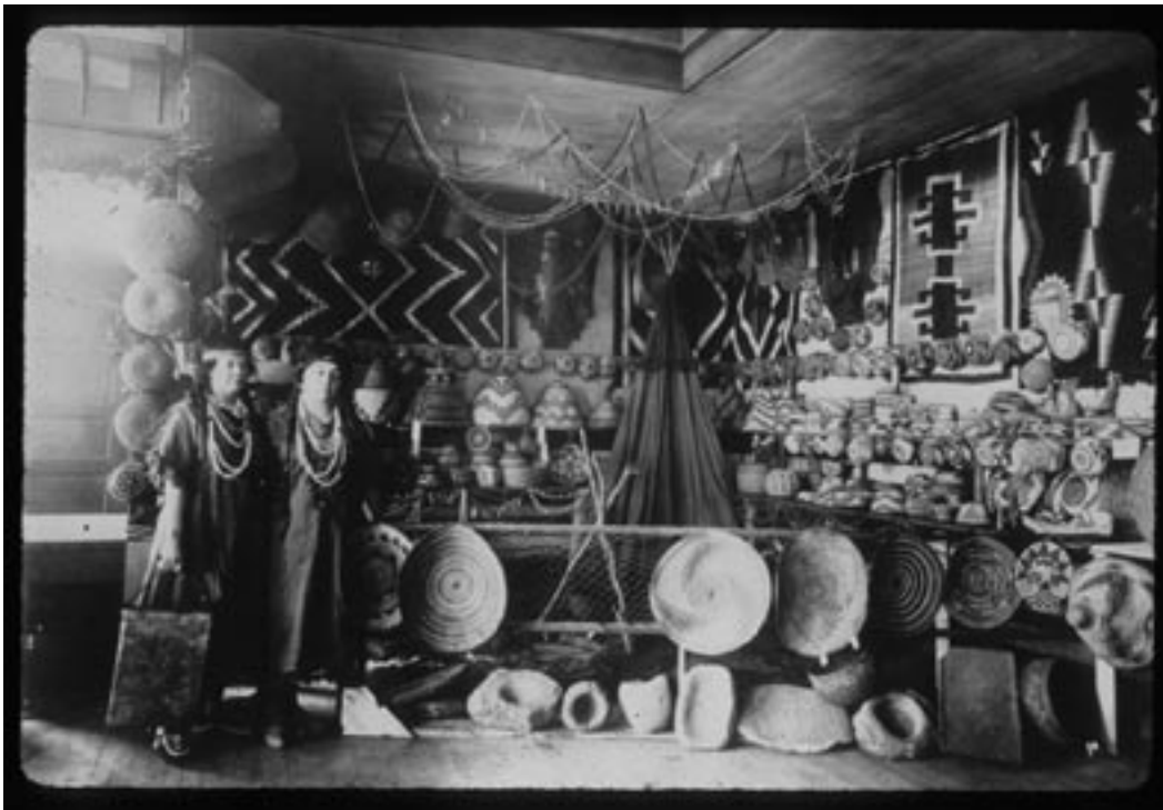
Hearn Collection, Yreka, c. 1900.

Among the more than 3,000 examples of western Native American basketry within the California State Parks–California Indian Heritage Center collections, are some notable assemblages made by mid-nineteenth century settlers of Northern California. These collections are significant from both an historical and ethnographic standpoint as they often include basketry made before the 1889 onset of the non-Native collector’s market for American Indian basketry. These “pre-market” pieces are generally the least represented in collections, inside or outside of museums, and provide the best—and sometimes the only—examples of older, conservative baskets whose makers intended them for family and communal use or view.