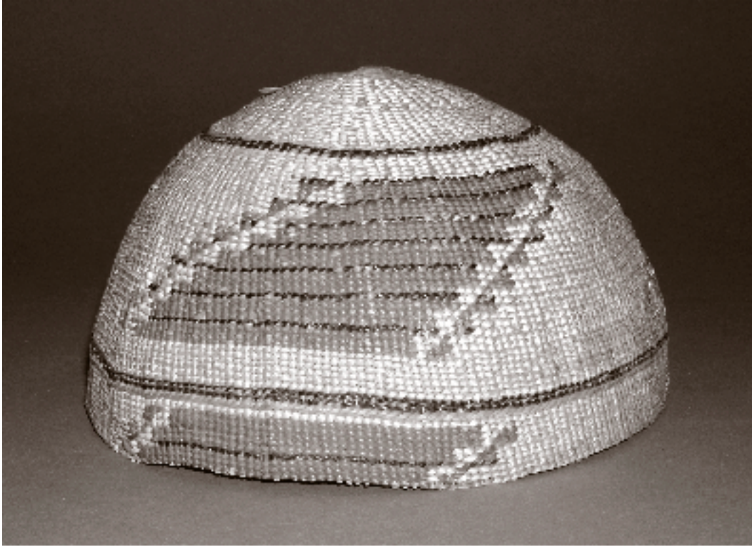
Woman's dress cap (Hupa or Karuk). Collected by Henry Diggles. Catalog No. 15-45.

Unfortunately, we don't really know how many years a cooking basket might have lasted or continued to be used within the context of the old way of life when baskets may have been cooked in two or three times a week. It is doubtful the baskets could have been more than eight or ten years old when collected. If collected as early as 1851 (the earliest date possible for Mr. Hearn), the baskets could date to as early as 1841. Nonetheless, these five pieces appear to be the oldest ethnographic baskets in the State collections.