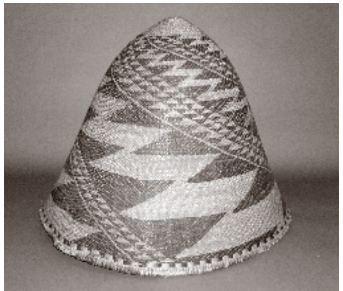
Burden basket (Pomo). Sedge root and redbud. Collected by E. S. MacCallum, c. 1885. Catalog No. MCC-14-55-SL.

A diagonal-twined burden basket in the MacCallum collection also represents a basketry genre that faded earlier than others. While the Pomo also utilized large bell form