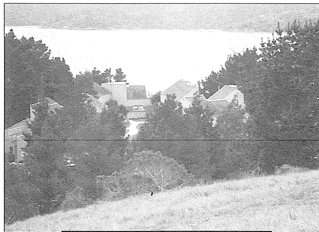
Marconi Conference Center's guestrooms overlook Tomaes Bay

We hope that between highly productive meetings you'll have some time to appreciate the rich human and natural history that surrounds us here. Please let us know if there is anything we can do to enhance your stay.