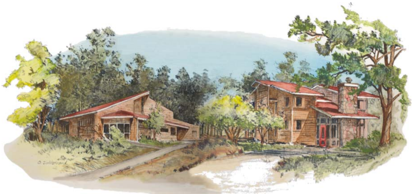
William Penn Mott Jr. Training Center