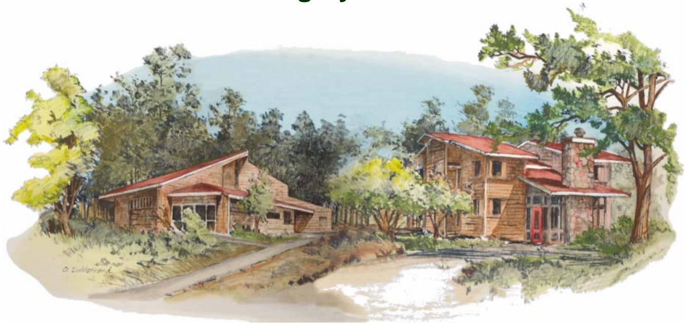
William Penn Mott Jr. Training Center