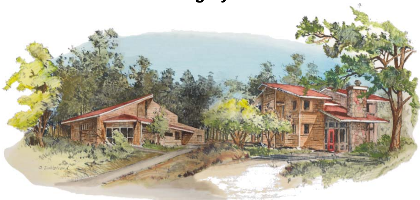
William Penn Mott Jr. Training Center