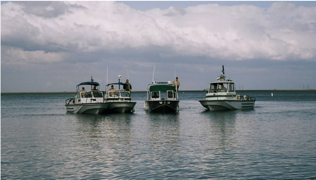
State Park patrol vessels on the water